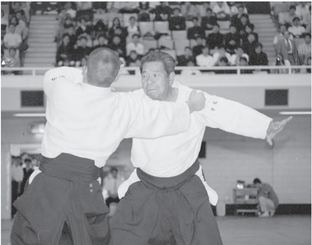
全日本合気道演武大会にて 1992 年 Performing at All-Japan Aikido Demonstration in 1992