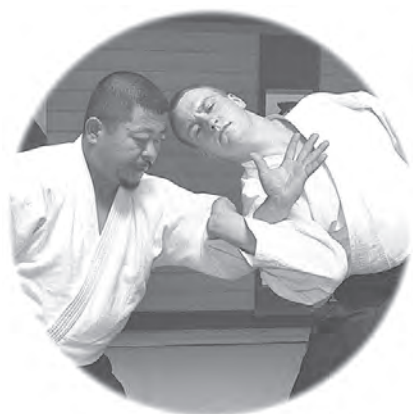
手の拡大 Detail of hand position