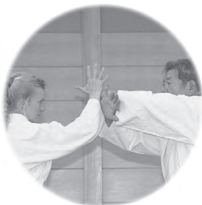
③の拡大 Detail of photo ③