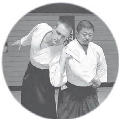
③の拡大 Detail of photo ③