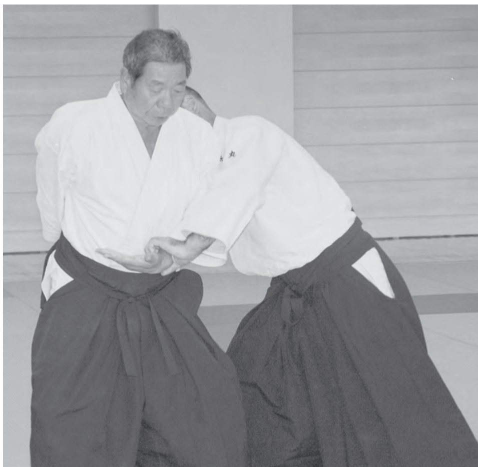
東京での講習会にて 1992年 At 1992 Tokyo seminar