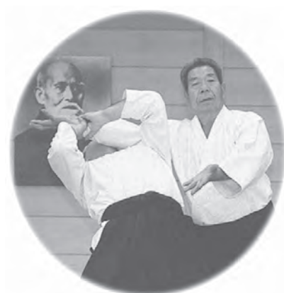
④の拡大 Detail of photo ④