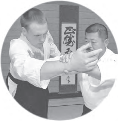
③の拡大 Detail of photo ③