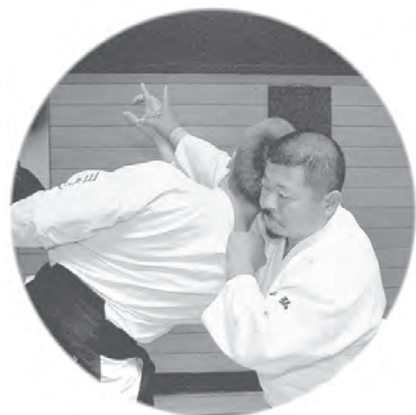
反対側から見た ④ Opposite view of photo ④