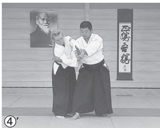
反対側から見た④ Opposite view of photo ④