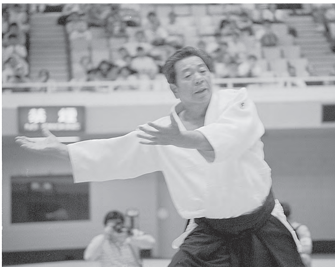
全日本合気道演武大会にて 1992 年 Performing at All-Japan Aikido Demonstration in 1992