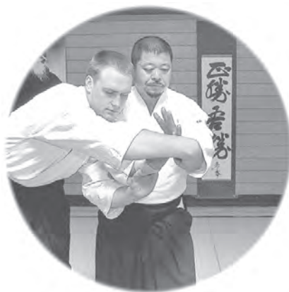
②の拡大 Detail of photo ②