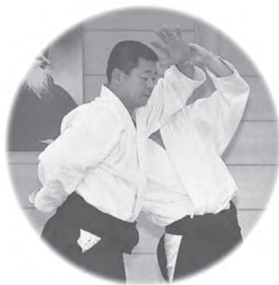
③の拡大 Detail of photo ③