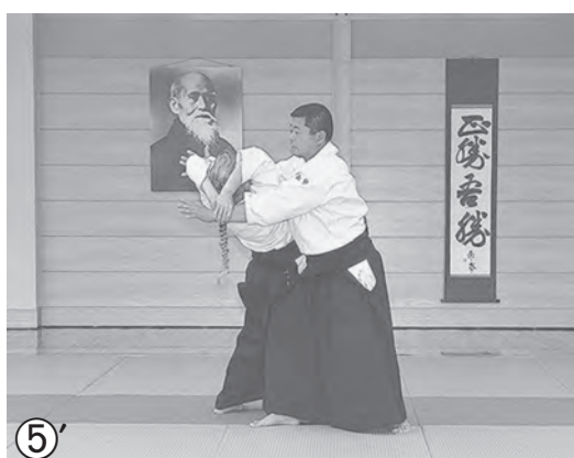
反対側から見た ⑤ Opposite view of photo ⑤