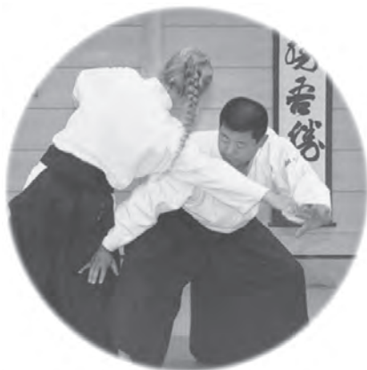
②の拡大 Detail of photo ②