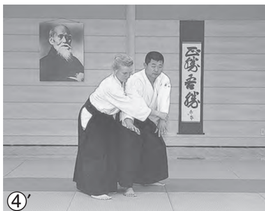
反対側から見た④ Opposite view of photo ④