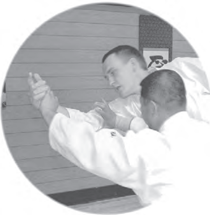
③の拡大 Detail of photo ③