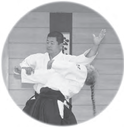
④の拡大 Detail of photo ④