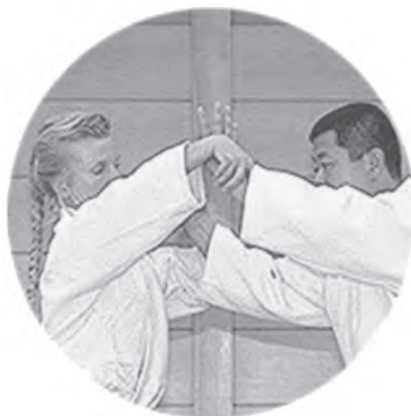
②の拡大 Detail of photo ②