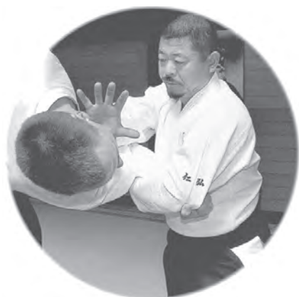
③の拡大 Detail of photo ③