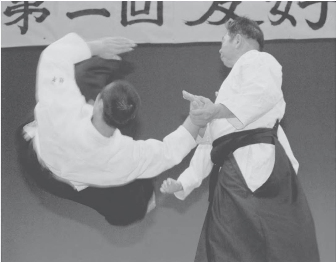
合気ニュース主催 友好演武会にて 1985年 Demonstrating at 1985 Friendship Demonstration sponsored by Aiki News