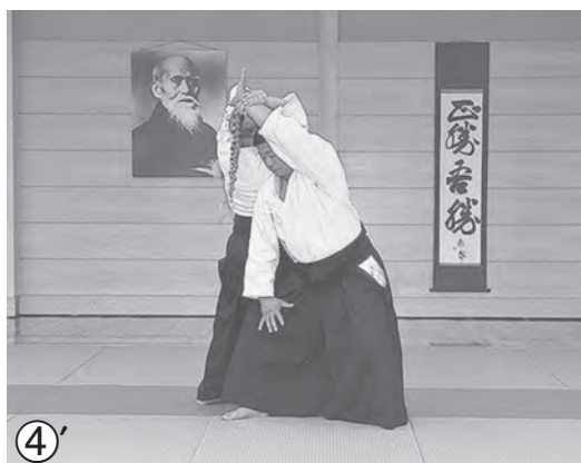
反対側から見た ④ Opposite view of photo ④