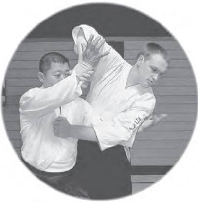
手の拡大 Detail of hand position