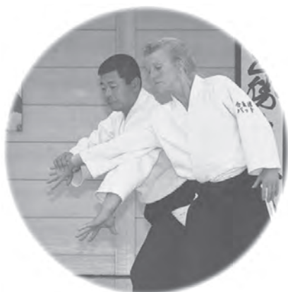
③の拡大 Detail of photo ③