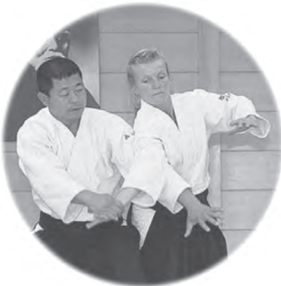
⑤の拡大 Detail of photo ⑤