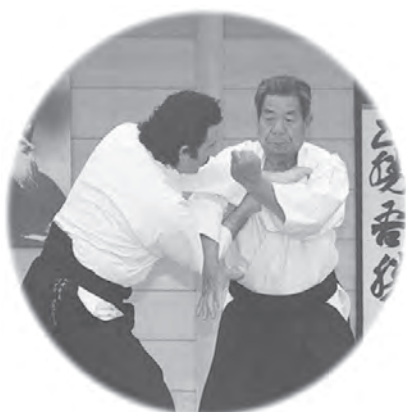
③の拡大 Detail of photo ③