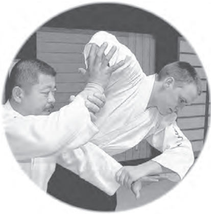
手の拡大 Detail of hand position