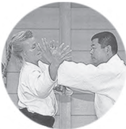
②の拡大 Detail of photo ②