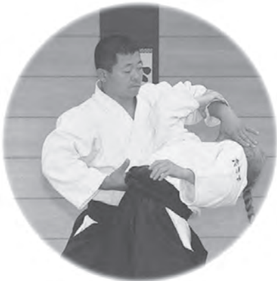
④の拡大 Detail of photo ④