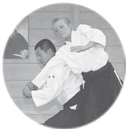
④の拡大 Detail of photo ④