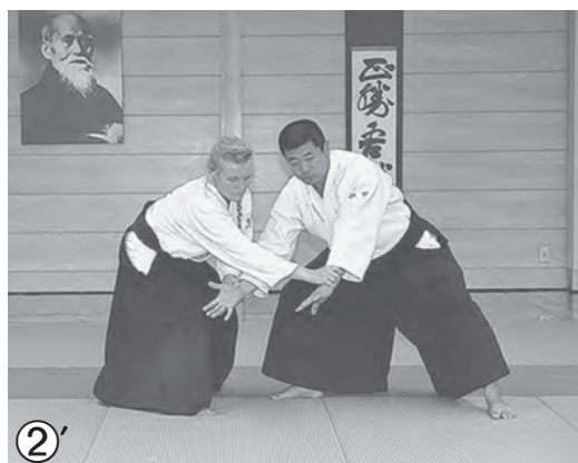
反対側から見た ❷ Opposite view of photo ❷