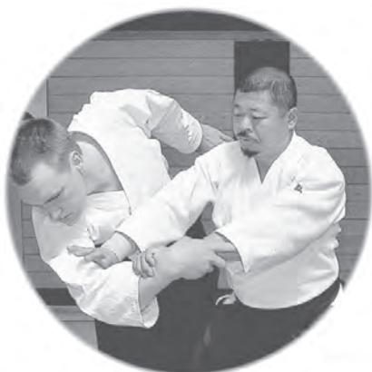
反対側から見た ③ Opposite view of photo ③