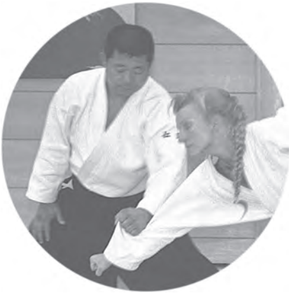
③の拡大 Detail of photo ③