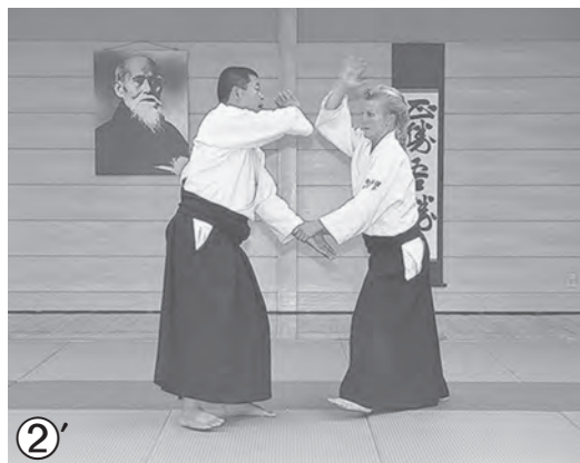
反対側から見た② Opposite view of photo ②