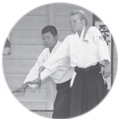
❷の拡大 Detail of photo ❷