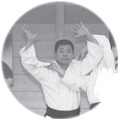
③の拡大 Detail of photo ③