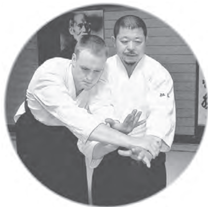
②の拡大 Detail of photo ②