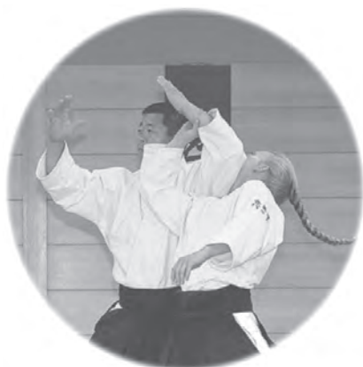
③の拡大 Detail of photo ③