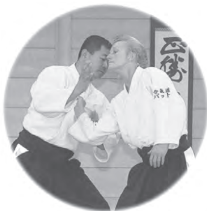
②の拡大 Detail of photo ②