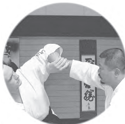
反対側から見た ③ Opposite view of photo ③