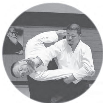
反対側から見た ④ Opposite view of photo ④