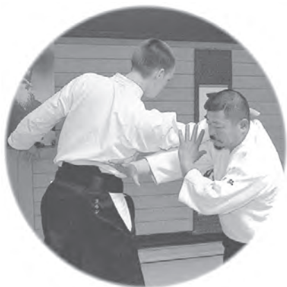
反対側から見た ③ Opposite view of photo ③