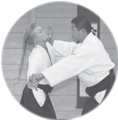
③の拡大 Detail of photo ③