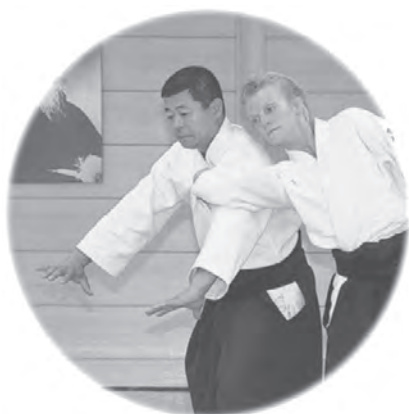
③の拡大 Detail of photo ③