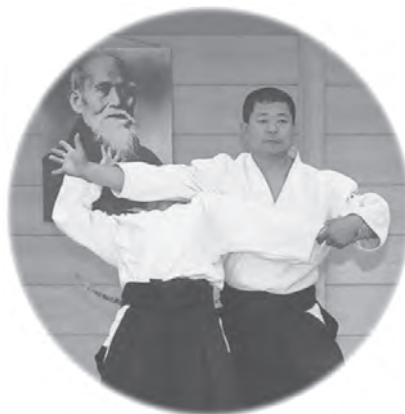
③の拡大 Detail of photo ③

④ Twist your hips and throw your partner to the rear.