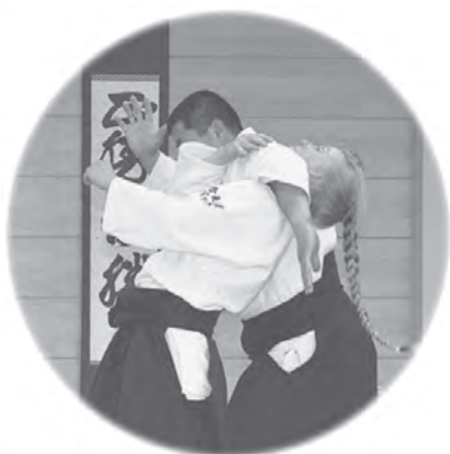
④の拡大 Detail of photo ④