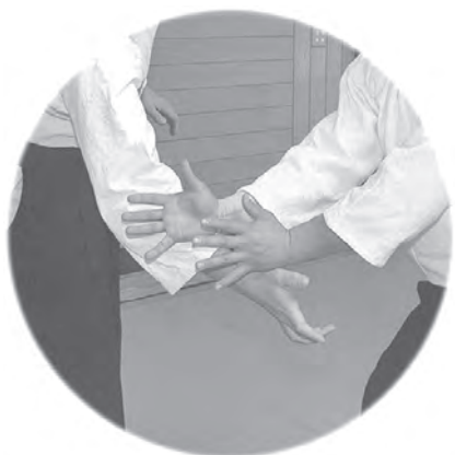
③の拡大 Detail of photo ③