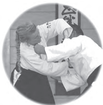
③の拡大 Detail of photo ③