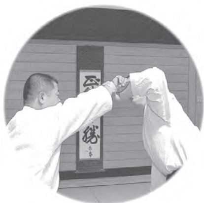
③の拡大 Detail of photo ③