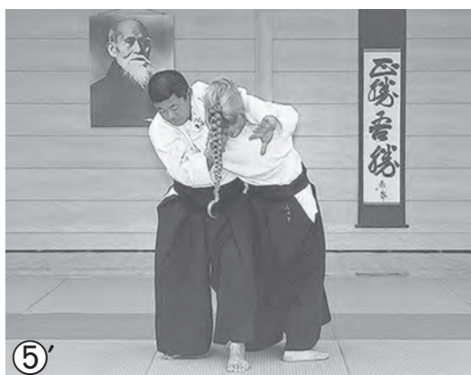
反対側から見た ⑤ Opposite view of photo ⑤