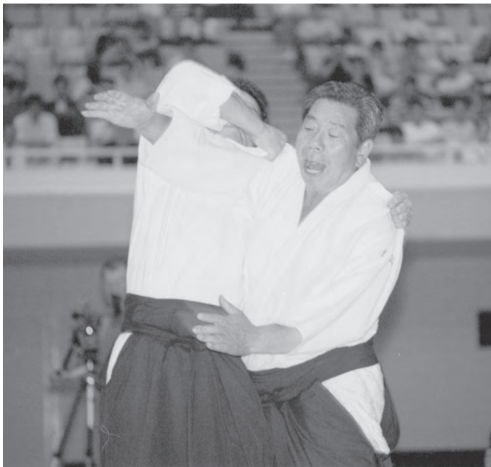
全日本合気道演武大会にて 1992年 受け：斉藤仁弘師範 Performing at All-Japan Aikido Demonstration; uke: Hitohiro Saito, 6th dan, 1992