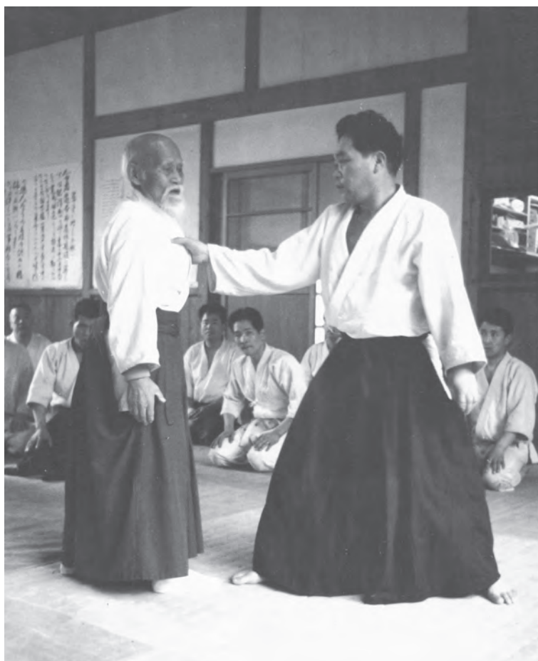
合気会本部道場で指導する植芝盛平翁 1967 年頃 Founder instructing at Aikikai Hombu Dojo, 1967