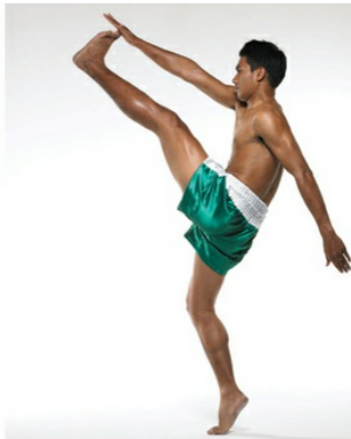
A–B: Leg swings to the front.