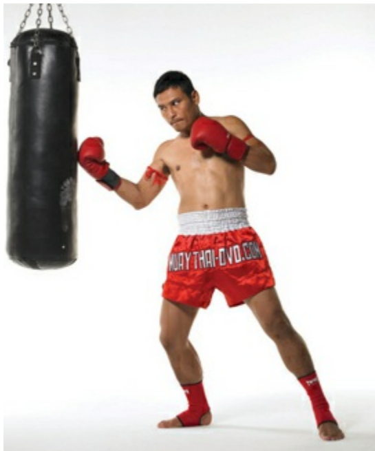
A: The front uppercut from a southpaw stance.