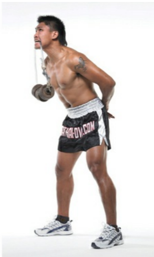
A-B: Tension on the back of the neck.