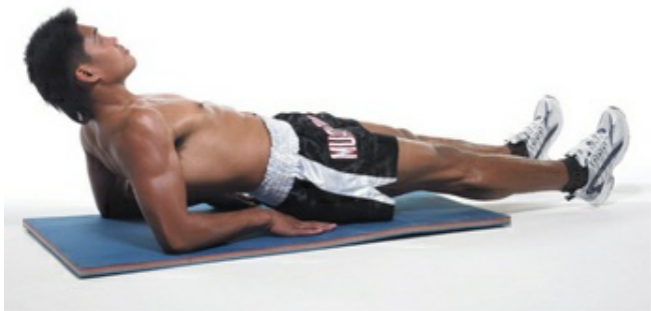
A-B: The starting and ending positions.