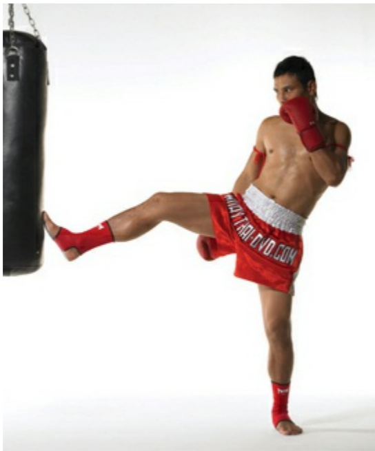
A: Saiyok the front push kick from a southpaw stance.