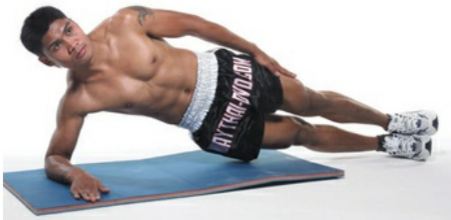
A-B: The starting and ending positions.