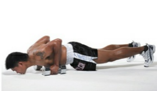
C–F: Rowing pushups.

Pushups on the fists help stabilize the wrists. Doing fist pushups on an exercise ball is very intensive.