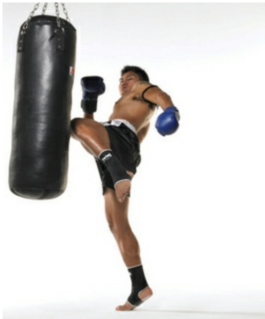
A: The front knee kick.