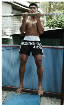
A–C: Pull-up sequence.