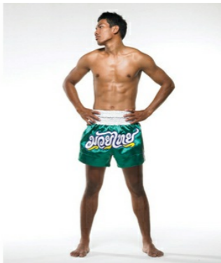
A–B: Moving the head.