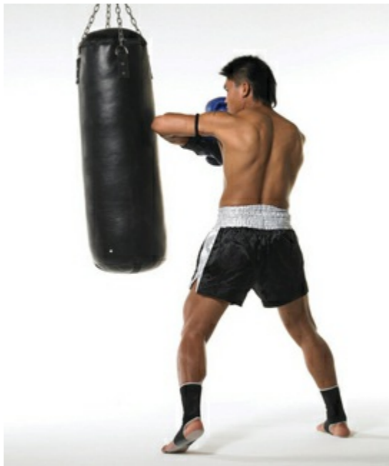
A: The front side elbow.