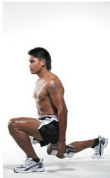
A-C: Lunge step sequence.