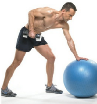
A-B: The starting and ending positions.