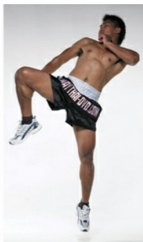
A-C: The sequence for jumping out of the squat.