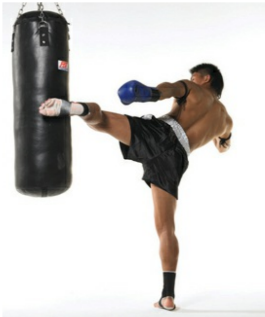
A: The round kick with the front leg.