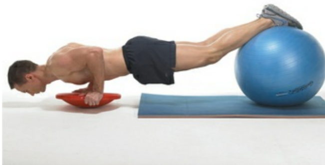
Pushups with a balance board and an exercise ball.

used this equipment before, you should put it to the test in these exercises. Training with equipment helps improve the interplay of muscles and provides excellent strengthening of the trunk muscles.