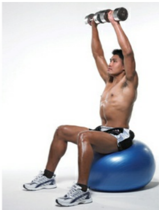
A–B: The starting and ending positions.