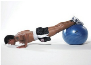
A–B: The starting and ending positions.