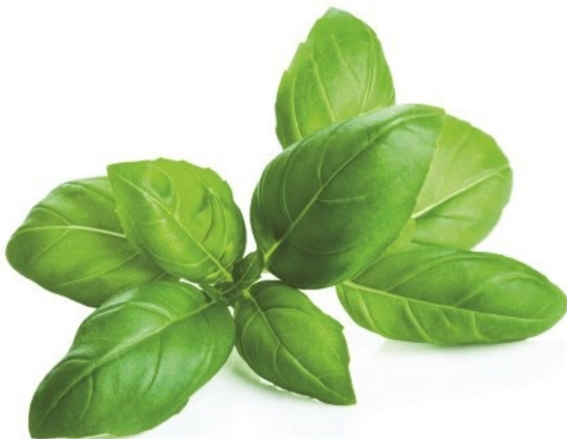
Basil, Sweet— Ocimum basilicum

Sweet basil is used both in medicine and for culinary purposes. There are several varieties of sweet basil, with the most common plant having dark green leaves, a bit of curl, and an aroma that is spicy, sweet, and herbaceous. The Latin name, basilicum , derives from the Greek word for the king's royal chamber. Some authorities say it is so named because its aroma is fit for a king. Safe to say, this is an oil to be treated like a king with respect to dilution. The leaves are steam distilled. Sweet basil is high in monoterpenols, and it is a top note.