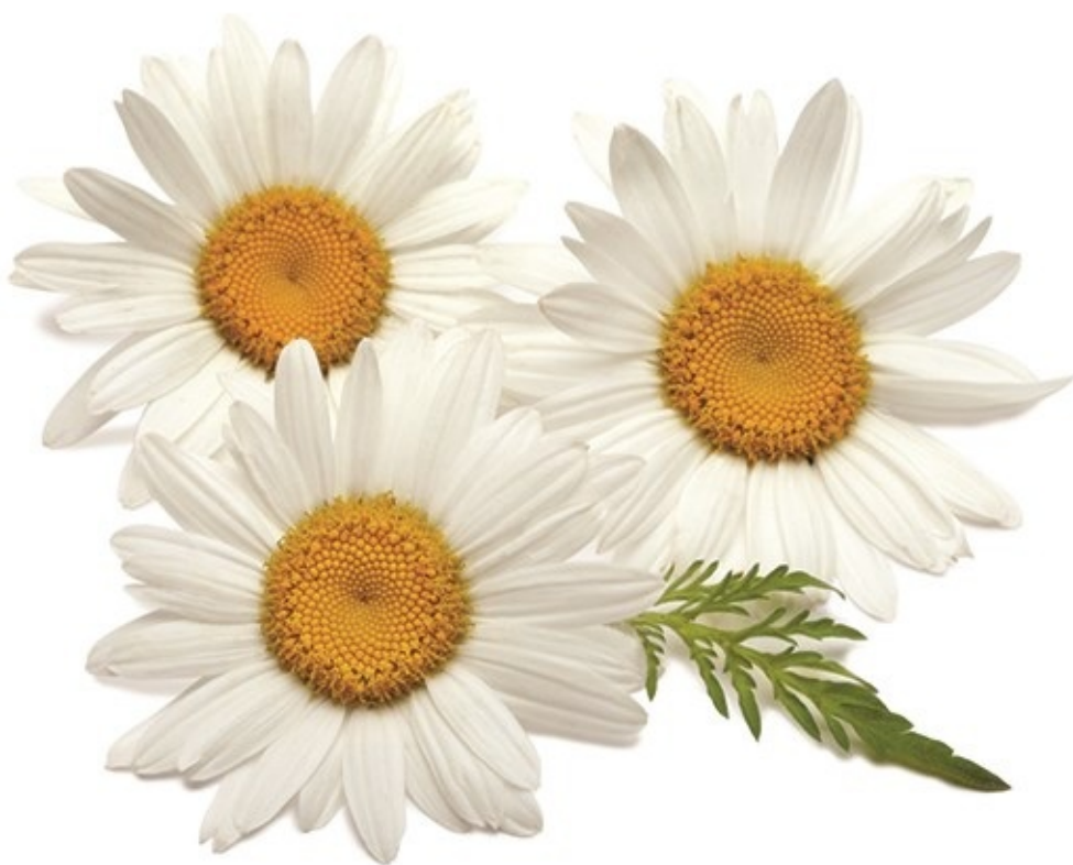
Chamomile, Roman— Anthemis nobilis

well with Roman chamomile are bergamot, clary sage, geranium, jasmine, lavender, lemon, rose, tea tree, and ylang-ylang.