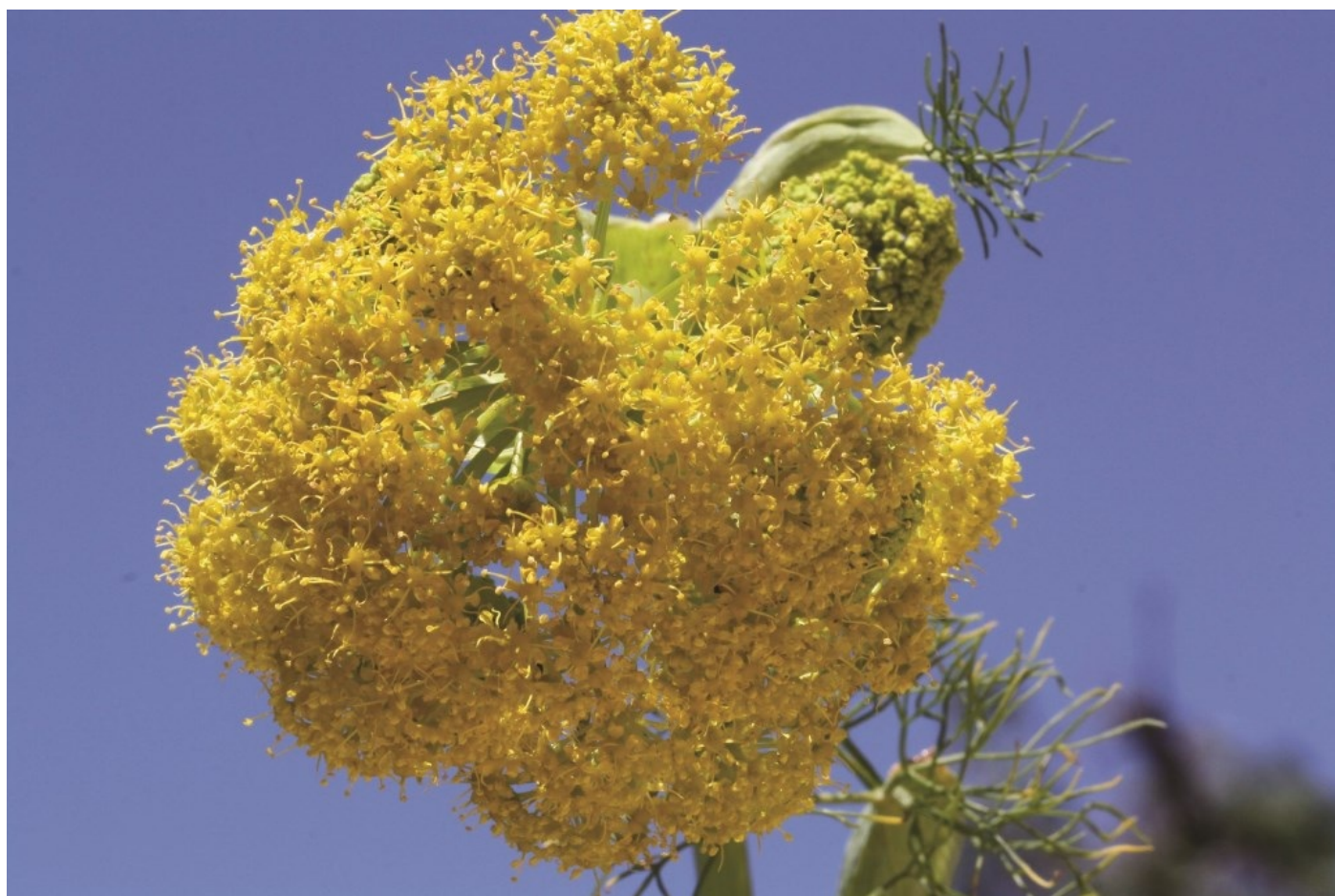
Galbanum— Ferula galbaniflua

earthy, woody, musky, sensual, and resinous. It blends well with jasmine, lavender, pine, and rose oils.