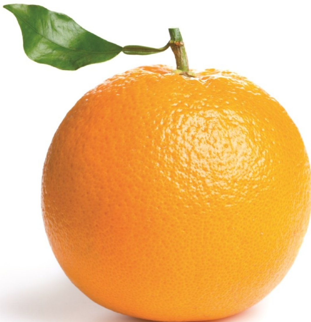
Orange, Sweet— Citrus × sinensis

aroma is fresh, sweet, fruity, citrusy, and tangy. Oils that blend well with orange are other citrus oils, clary sage, geranium, jasmine, lavender, rose, vetiver, and ylang-ylang.