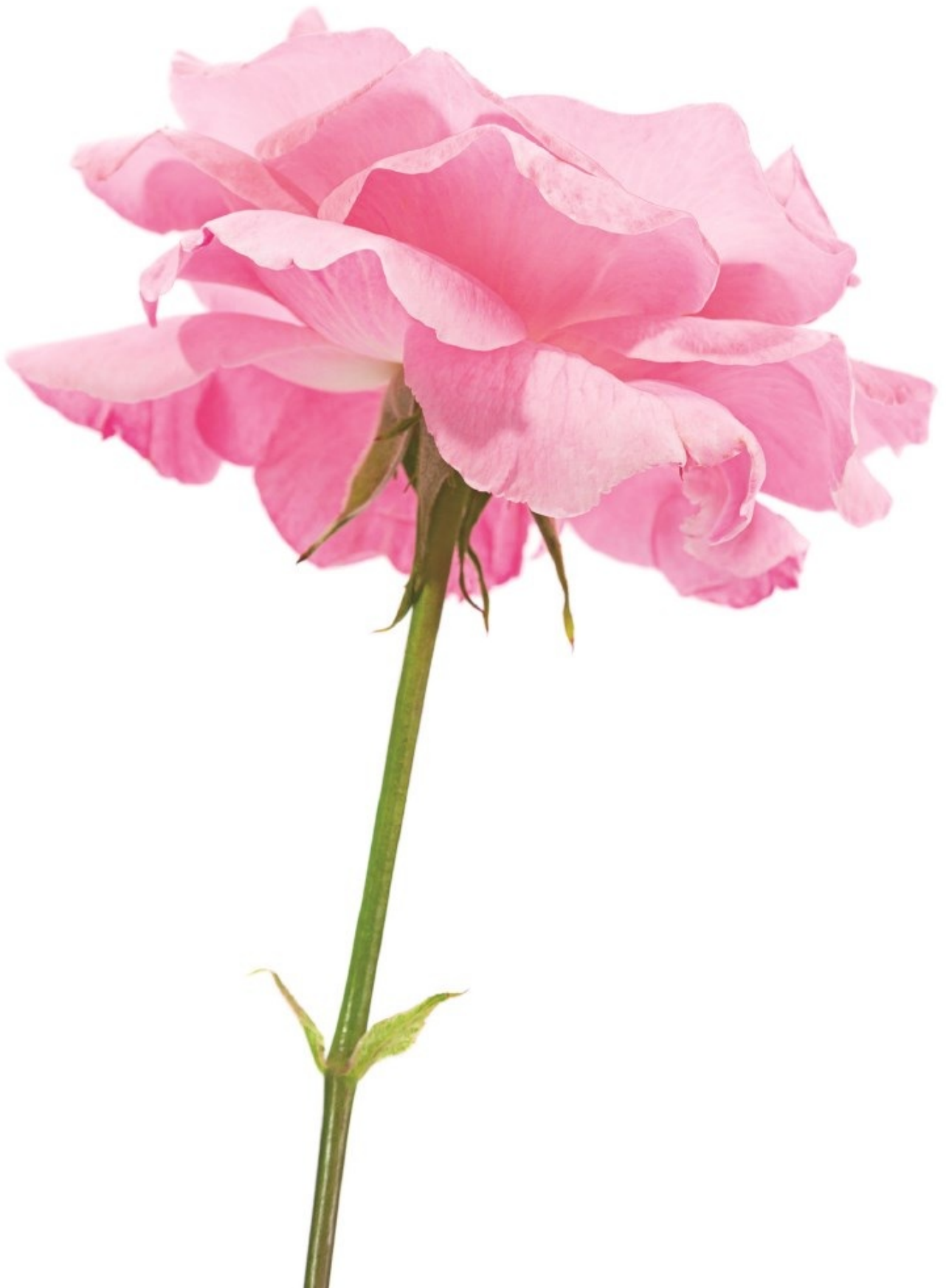
Rose Ott, Bulgarian— Rosa × damascena

and all you need to do is let it warm to room temperature for it to return to a pourable viscosity.