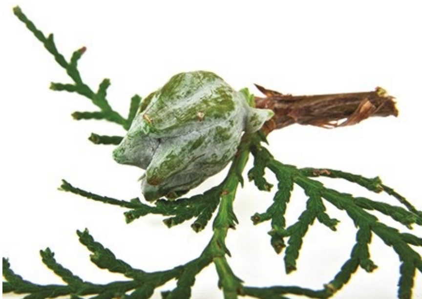
Cypress, Blue— Callitris intratropica

Analgesic, Antibacterial, Anti-inflammatory, Sedative, Skin tonic, Warming