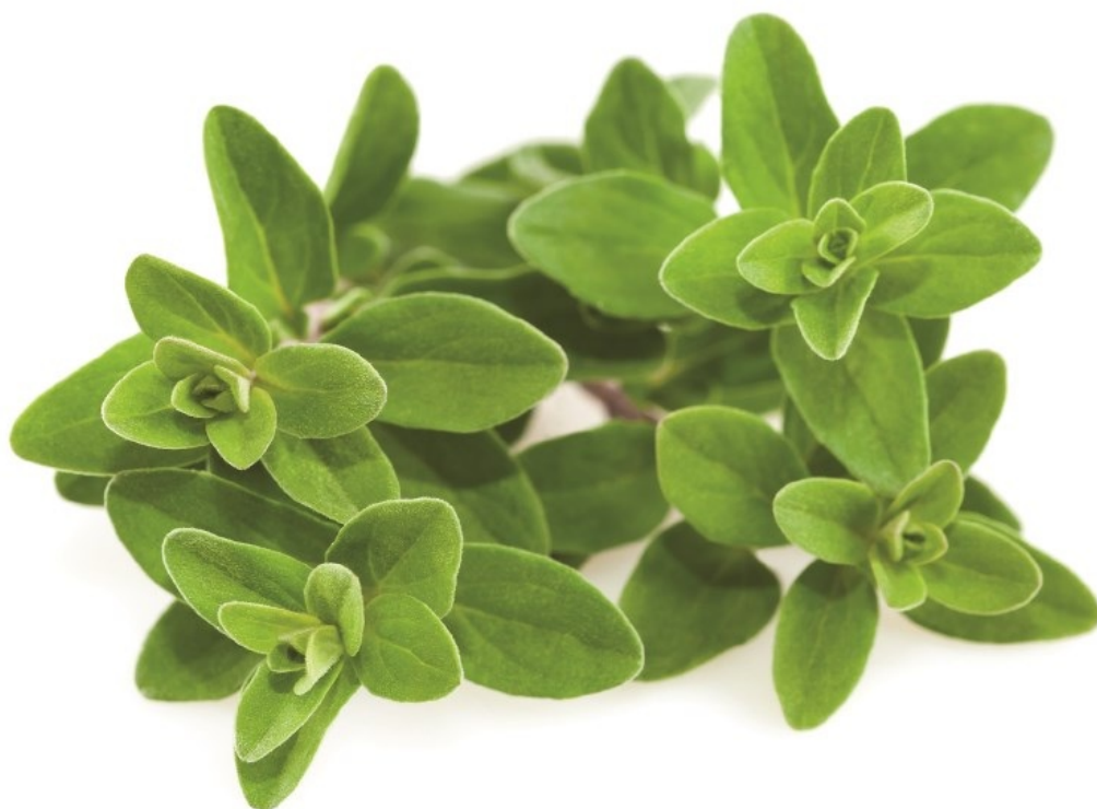
Marjoram, Sweet— Origanum majorana

Analgesic, Antibacterial, Antifungal, Anti-inflammatory, Antispasmodic, Calmative, Hypotensive, Immune-system stimulant