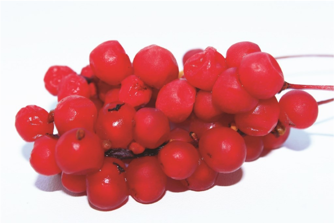
Schisandra CO2— Schisandra sphenanthera

Antioxidant, Anti-inflammatory, Relaxant, Skin regenerating