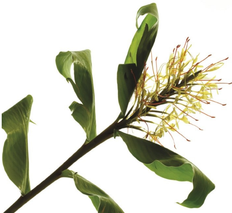
Ginger Lily— Hedychium spicatum

Analgesic, Antianxiety, Antidepressant, Anti-inflammatory, Aphrodisiac, Calmative, Sedative