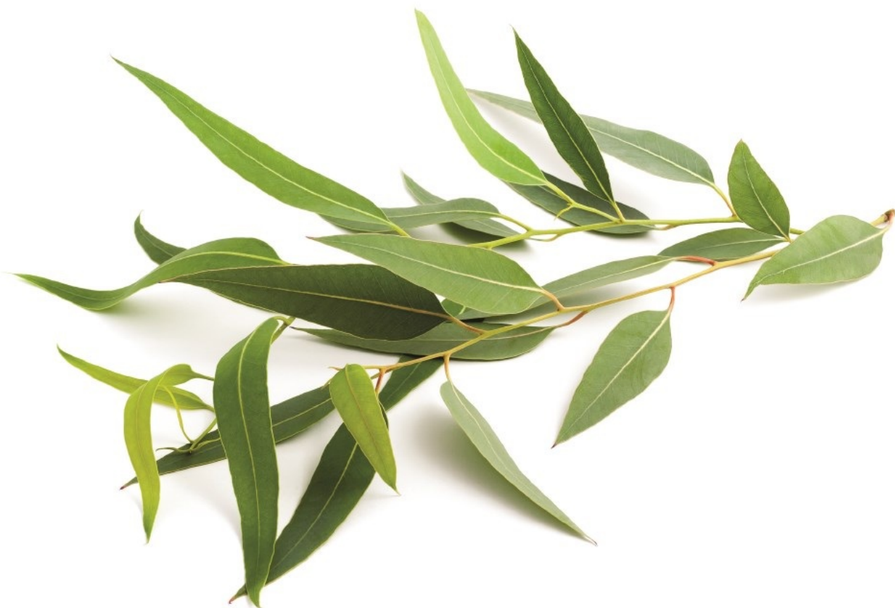
Eucalyptus Radiata— Eucalyptus radiata

chamomile (both Roman and German varieties), ginger, juniper berry, lavender, black pepper, peppermint, sweet marjoram, and tea tree.