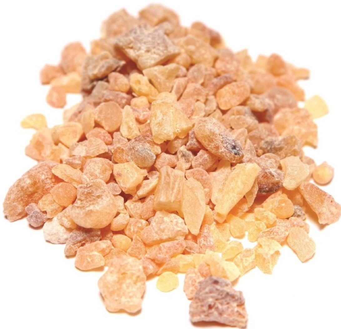
Frankincense— Boswellia carterii

musky, warm, and slightly citrusy. Frankincense blends well with clary sage, cypress, geranium, spice oils, and ylang-ylang.