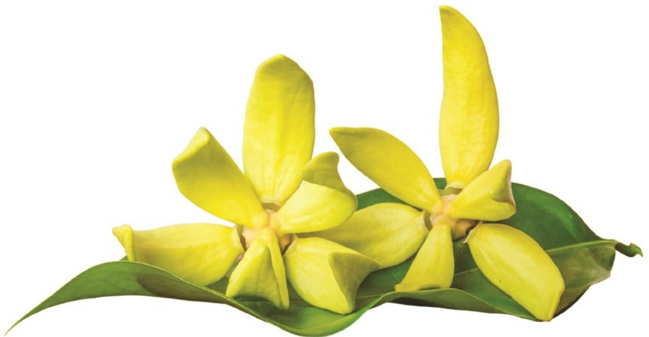
Ylang-Ylang— Cananga odorata

ylang means “flower of flowers” and rightly so! Ancient folklore indicates the flowers were put in coconut oil until the aroma was absorbed and then used to prevent fever and infectious disease. It has also been noted as a treatment for hair. The flowers are steam distilled to release a middle-to-base-note oil that is high in the chemical families of esters and sesquiterpenes. The aroma is truly exotic, sensual, strong, sweet, and floral. Oils that blend well with ylang-ylang are bergamot, clary sage, grapefruit, jasmine, lavender, neroli, and rose.