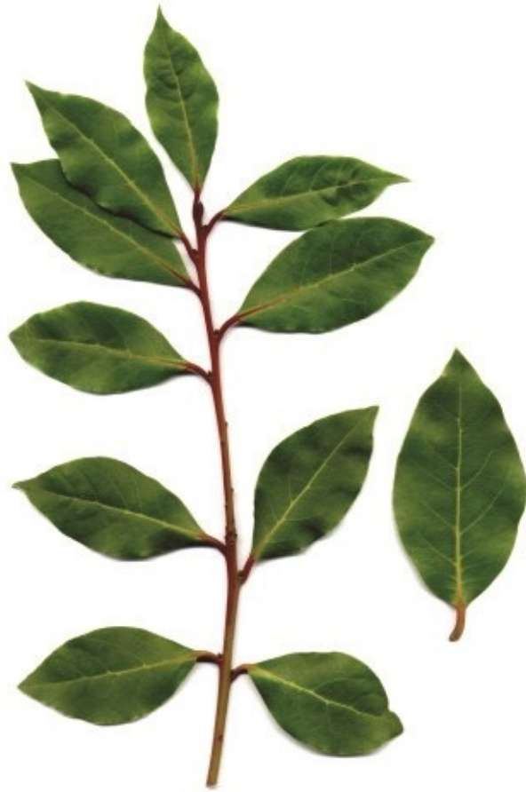
Bay Laurel— Laurus nobilis

This is a slow-growing plant that typically begins in a planter. It grows into a tall tree with shiny leaves. Here are some fun facts about bay laurel: Winners at the ancient Olympic games were crowned with wreaths of laurel leaves. In ancient Rome, wreaths made of bay leaves were used for commanders to celebrate their wins on the battlefield. This is why it's sometimes referred to as Roman laurel.