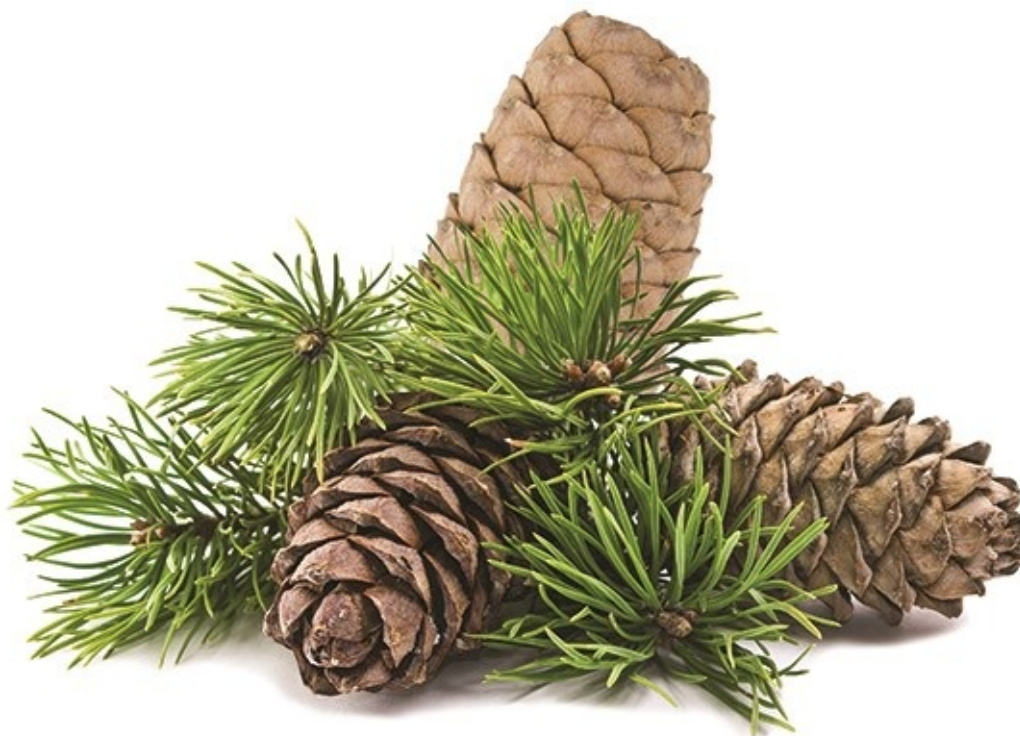
Pine, Siberian— Abies sibirica

woody, and balsamic. Oils that blend well with Siberian pine are cedar, cypress, eucalyptus, helichrysum, juniper berry, lavender, rosemary, and tea tree.