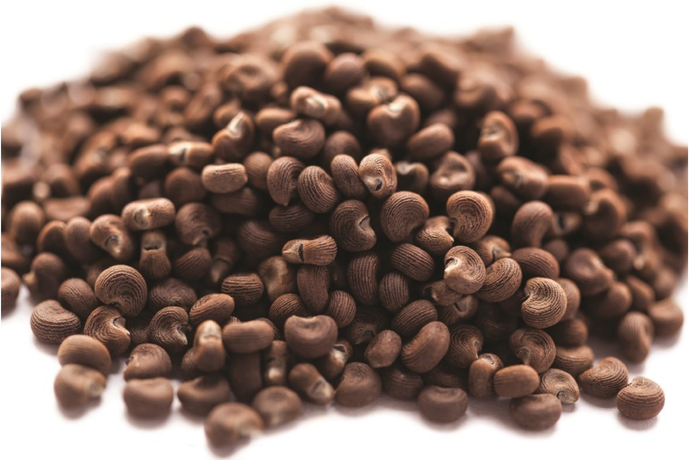
Sandalwood— Santalum album

Sandalwood is rich in history. Ancient Chinese and Indian Ayurveda medicine used it widely to treat infections, anxiety, depression, and digestive ailments and to aid in skin care. It was also used in perfume making and employed extensively in spiritual meditation and incense. The trunk (wood) of the tree is steam distilled to release a pale yellow-gold base-note oil. The aroma is earthy, exotic, warm, woody, and balsamic. Oils that blend well with sandalwood are bergamot, geranium, lavender, myrrh, black pepper, rose, vetiver, and ylang-ylang.