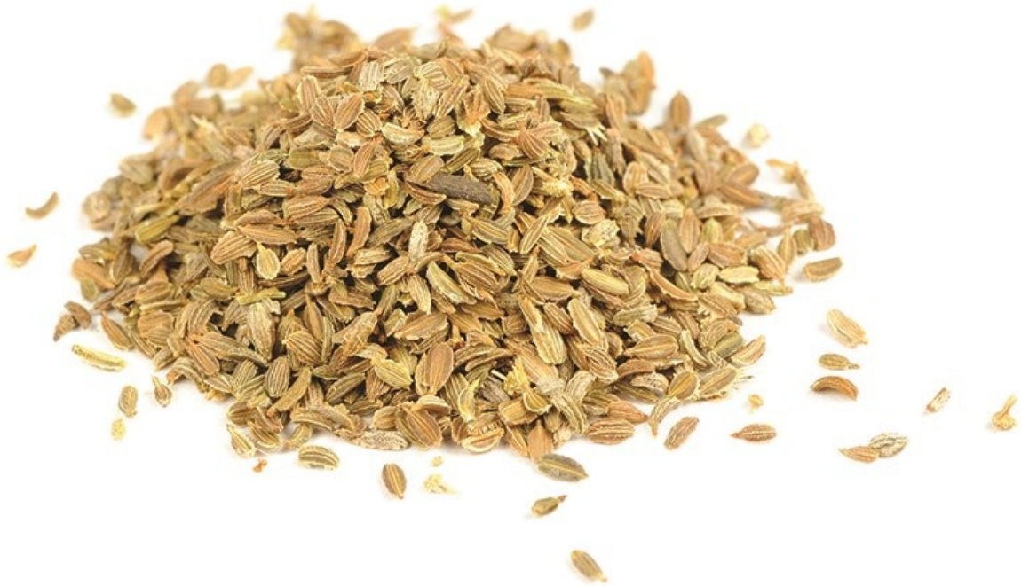
Carrot Seed— Daucus carota

golden yellow or an orange-brown amber. The aroma is earthy, fresh, herbaceous, and sometimes slightly floral. Oils that blend well with carrot seed are bergamot, geranium, lavender, lemon, and orange.