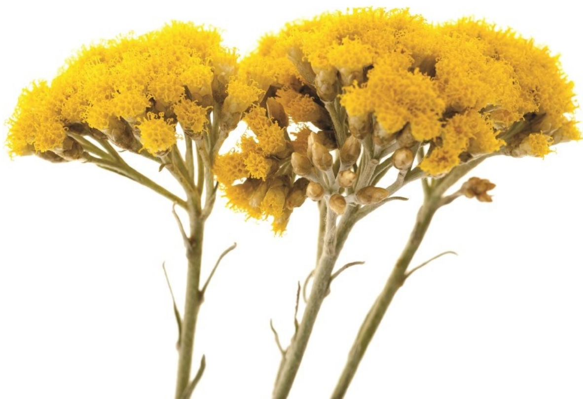
Helichrysum— Helichrysum italicum v. serotinum

soft, slightly sweet, and earthy. Oils that blend well with helichrysum are bergamot, citrus oils, clary sage, clove, cypress, frankincense, geranium, juniper, lavender, neroli, rose, rosewood, sandalwood, and vetiver.