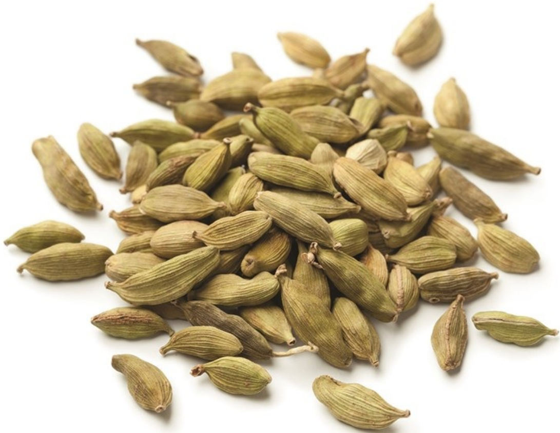
Cardamom— Elettaria cardamomum

long silky leaves. The flowers and seeds of the plant are steam distilled, releasing a middle-note oil that belongs in esters and oxides. It is related to ginger, having several similar properties, especially the ability to warm and tone the system. The aroma is spicy, sweet, and warm. Oils that blend well with cardamom are frankincense, geranium, juniper, orange, rosewood, and other spice oils.