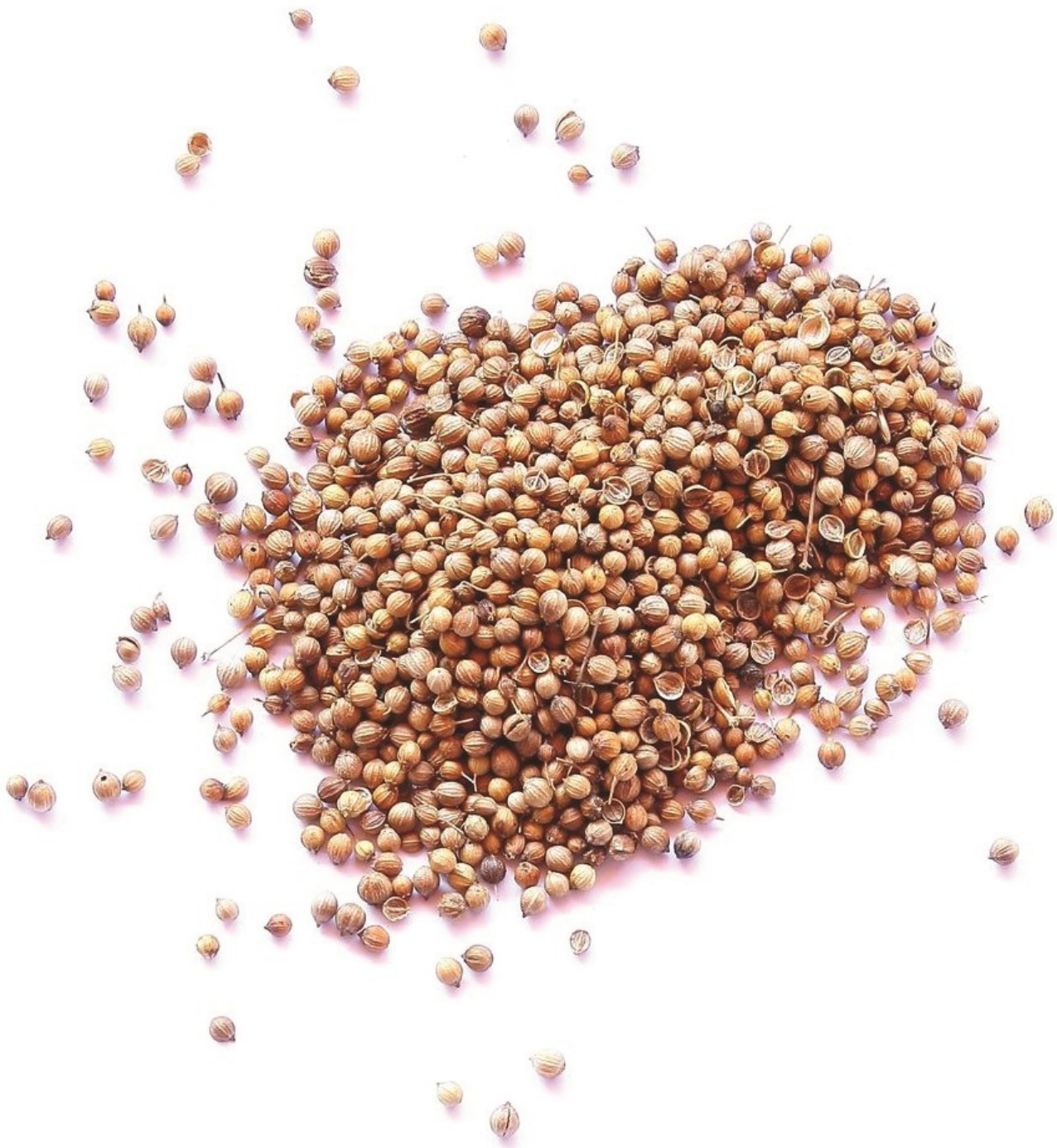
Celery Seed— Apium graveolens

Antiarthritic, Anti-inflammatory, Antioxidant, Antiseptic, Diuretic, Immune-system stimulant, Sedative