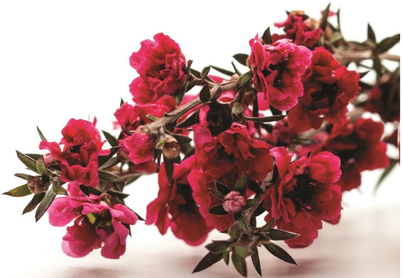
Manuka, East Cape— Leptospermum scoparium

sesquiterpenes. It is a middle-note oil with an aroma that is honeylike, sweet, herbaceous, and medicinal. Oils that blend well with manuka are bergamot, peppermint, rose, rosemary, sandalwood, thyme, vetiver, and ylang-ylang.