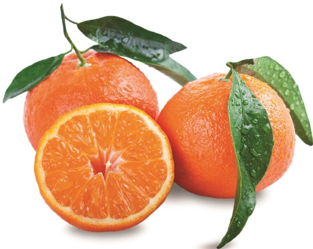
Mandarin, Red— Citrus reticulata

Analgesic, Antibacterial, Antidepressant, Anti-inflammatory, Antioxidant, Antiseptic, Antispasmodic, Antiviral, Carminative, Digestive, Expectorant, Sedative