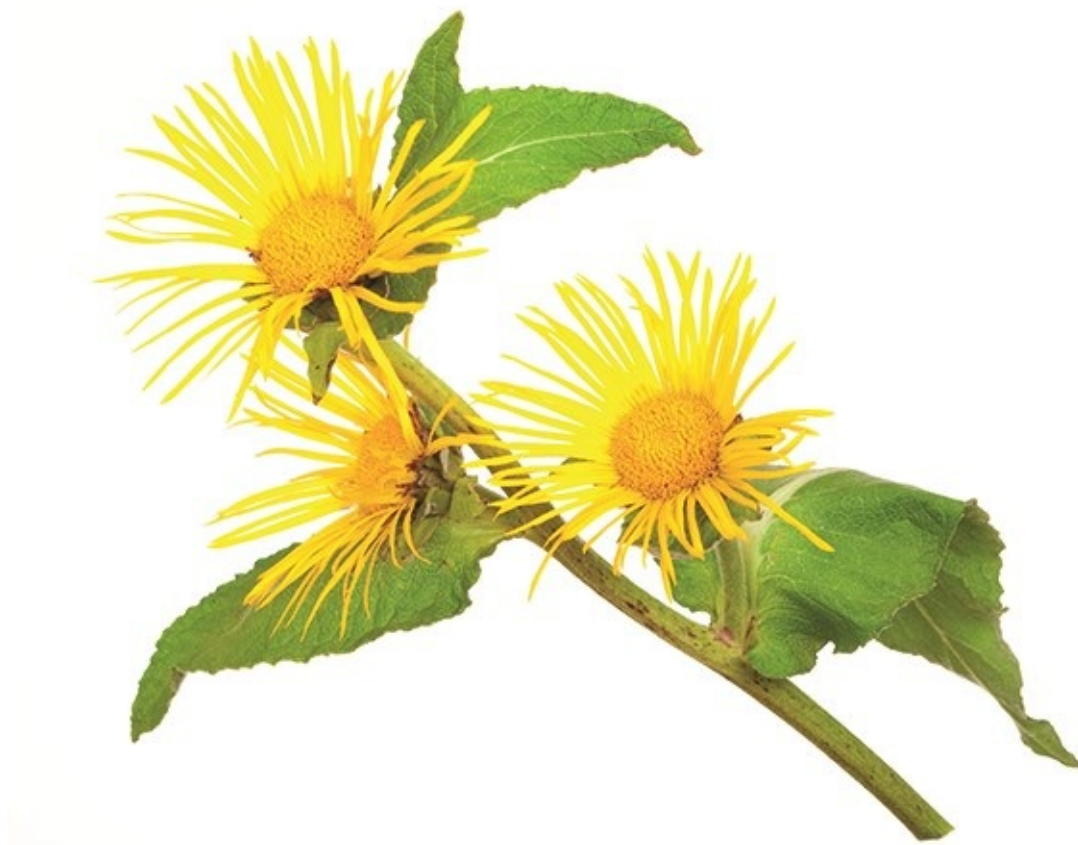
Inula— Inula graveolens

Analgesic, Antiallergenic, Antianxiety, Antiasthmatic, Antibacterial, Anti-inflammatory, Antispasmodic, Antiviral, Expectorant, Immune-system support, Sedative