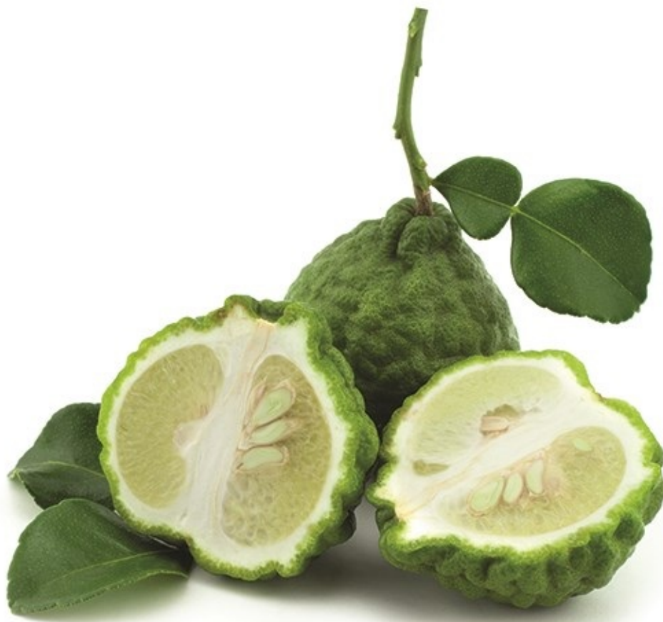
Bergamot— Citrus bergamia

Antibacterial, Antidepressant, Anti-infective, Anti-inflammatory, Antispasmodic, Antiviral, Carminative, Sedative