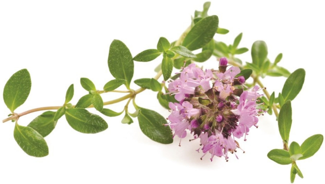
Marjoram, Spanish— Thymus mastichina

steam distilled to release a clear to pale yellow oil with a thin viscosity that is a medium note. The aroma is spicy, warm, herbaceous, and medicinal. Oils that blend well with Spanish marjoram are basil, chamomile, clary sage, cypress, frankincense, lavender, orange, rosewood, tea tree, and thyme.