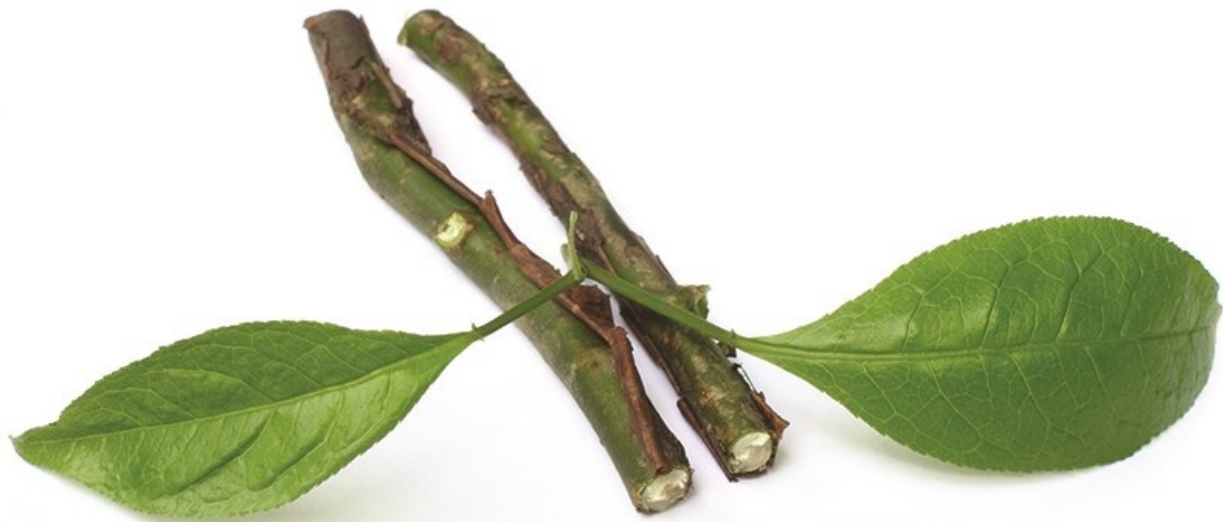
Amyris— Amyris balsamifera

Amyris balsamifera is a small tree with dense clusters native to the Caribbean and Gulf of Mexico. Due to the high oil content in the wood it is extremely flammable and can be used as a torch; thus it's sometimes referred to as "torchwood." The wood is steam distilled to retrieve the thick, viscous, and beautiful golden yellow essential oil. Though botanically separate, the fragrance is similar to sandalwood, being woody and sweet with a touch of pepper. Amyris has been used in place of sandalwood due to the difference in cost, but it is not an exact replacement. The most common use of amyris is for soaps, perfume, and blends needing a fixative, since this oil will anchor the scent, bringing a needed stability. The extraction method used is steam distillation, and it is a base-note oil.