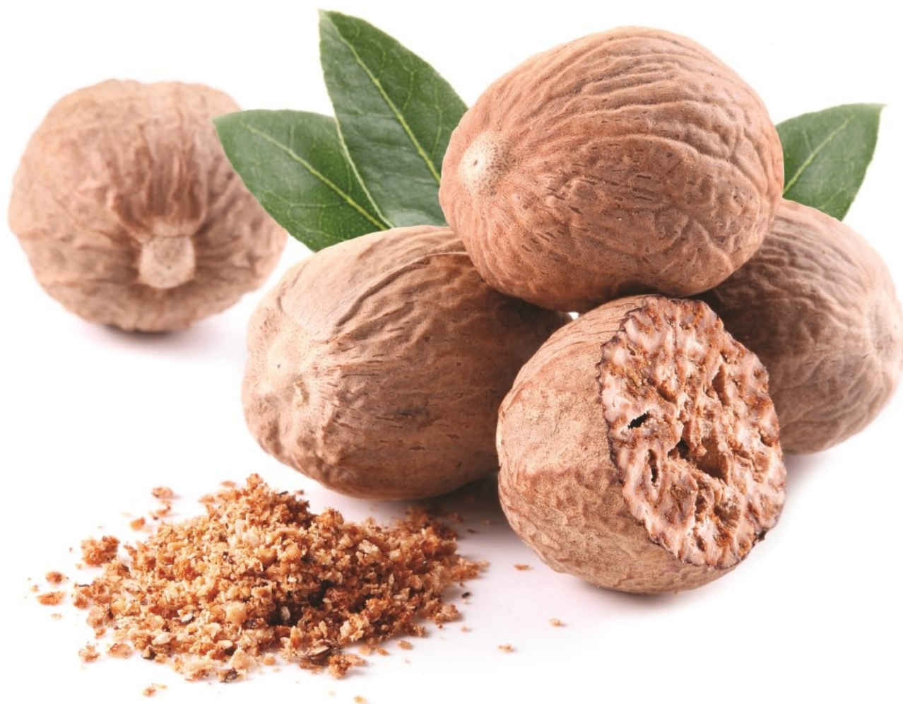
Nutmeg— Myristica fragrans

dispels anxiety, and puts one into a dream state during sleep. The Indians would use nutmeg for intestinal challenges and the Egyptians used it for embalming. The seeds are dried and then steam distilled to release an oil that is a middle-to-base note and high in monoterpenes. The aroma is exotic, warm, spicy, sweet, and musky. Oils that blend well with nutmeg are clary sage, cypress, geranium, orange, black pepper, and rosemary.