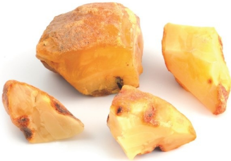
Elemi— Canarium luzonicum

[CP-fl Analgesic, Antibacterial, Antiemetic, Antifungal, Anti-infective, Anti-inflammatory, Antiseptic, Expectorant, Sedative, Stimulant