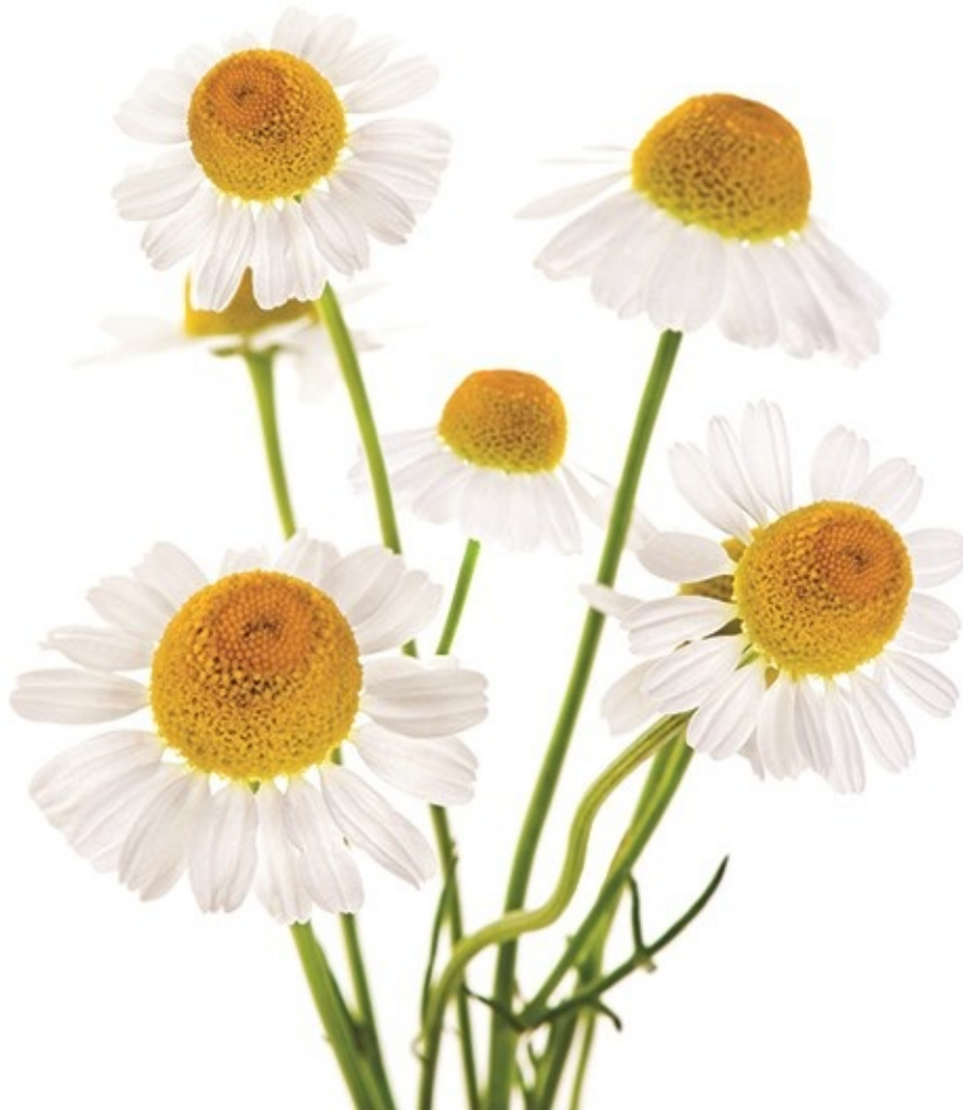
Chamomile, German— Matricaria recutita

German chamomile are bergamot, clary sage, geranium, grapefruit, jasmine, lavender, lemon, rose, tea tree, and ylang-ylang.