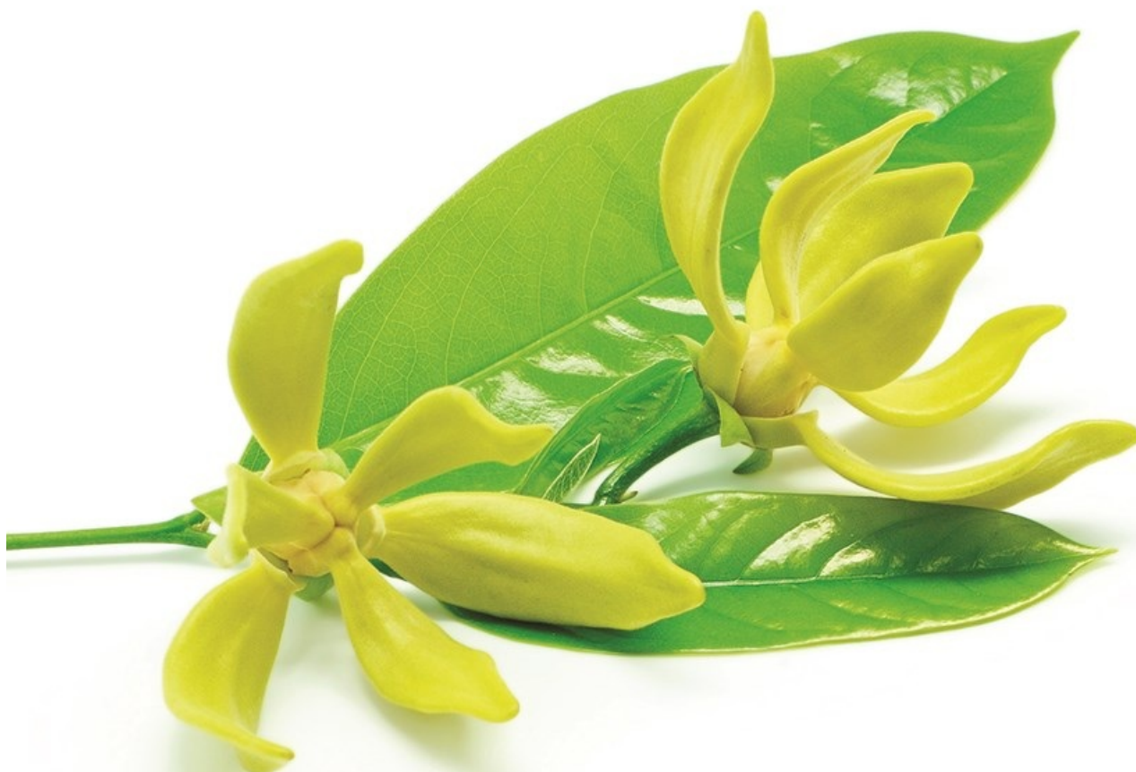
Cananga— Cananga odorata

Antibacterial, Antidepressant, Antiseptic, Aphrodisiac, Circulatory stimulant, Nervine, Sedative