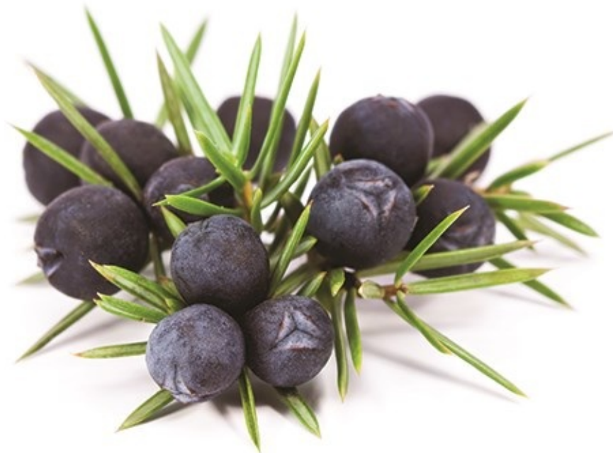
Juniper Berry— Juniperus communis

The history is the same as juniper berry CO 2 . This essential oil is steam distilled from the berries of the tree. The oil is a middle-to-top note with an aroma that is piney, balsamic, woody, warm, and radiant. It is high in monoterpenes. Oils that blend well with juniper berry are bergamot, all citrus oils, cypress, geranium, lavender, rosemary, and tea tree.