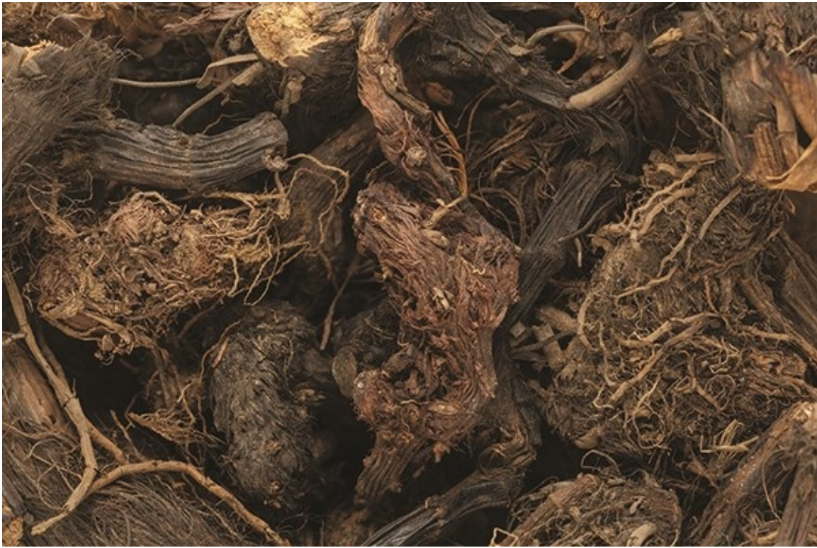
Spikenard— Nardostachys jatamansi

Analgesic, Antianxiety, Antifungal, Anti-inflammatory, Antispasmodic, Calmative, Insect repellent, Nervous-system tonic, Sedative