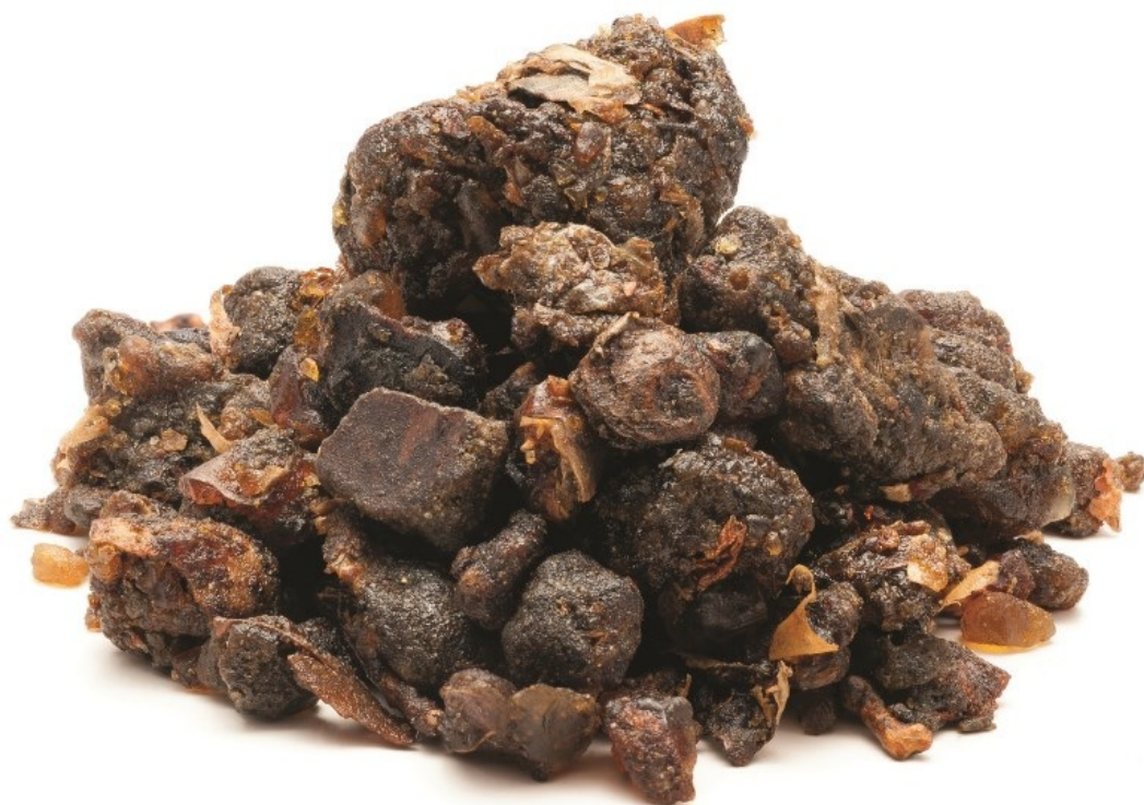
Opopanax— Commiphora guidotti

monoterpenes and sesquiterpenes. Oils that blend well with opopanax are all citrus, frankincense, lavender, patchouli, and sandalwood.