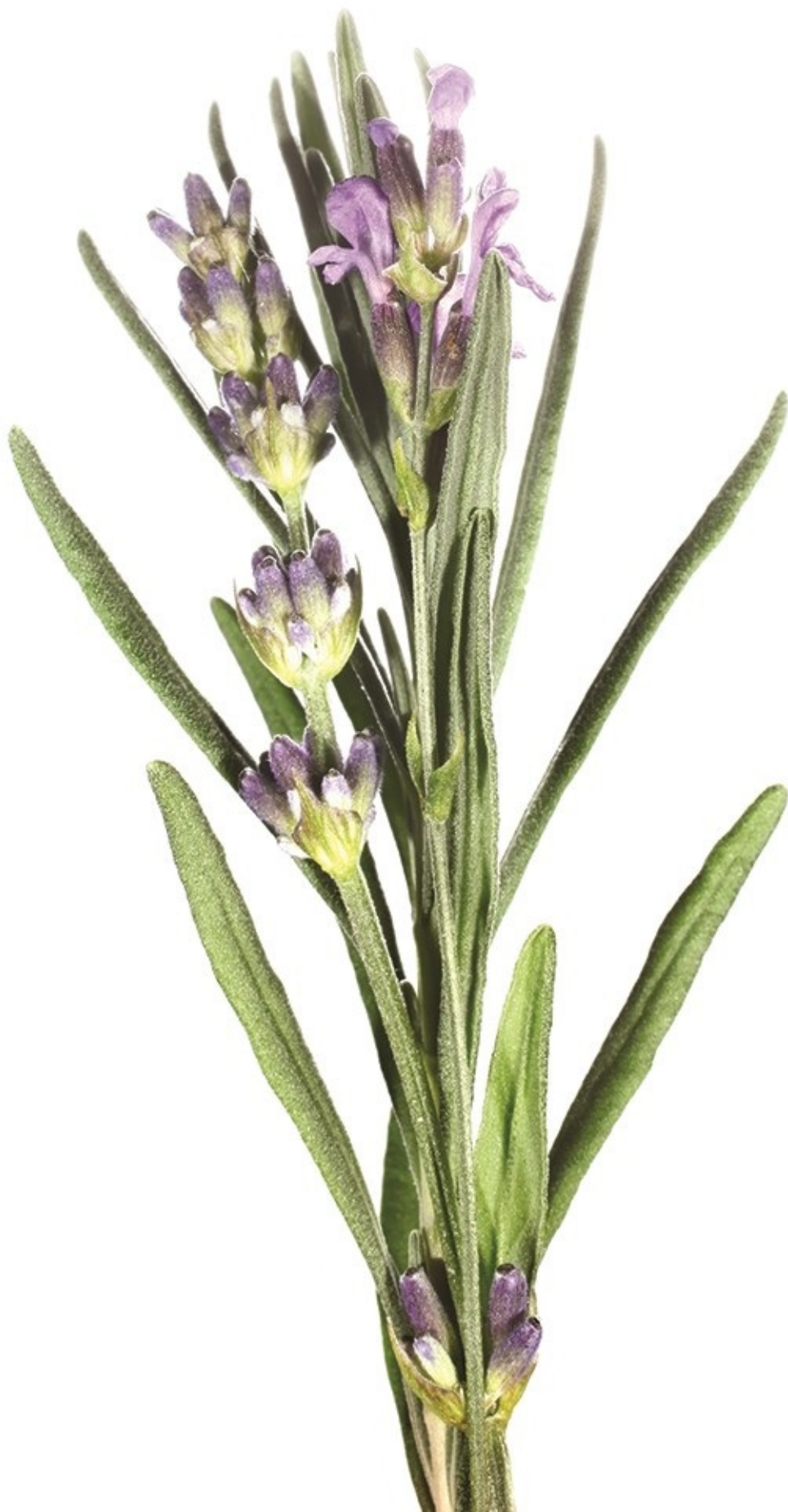
Lavender, Bulgarian— Lavandula angustifolia