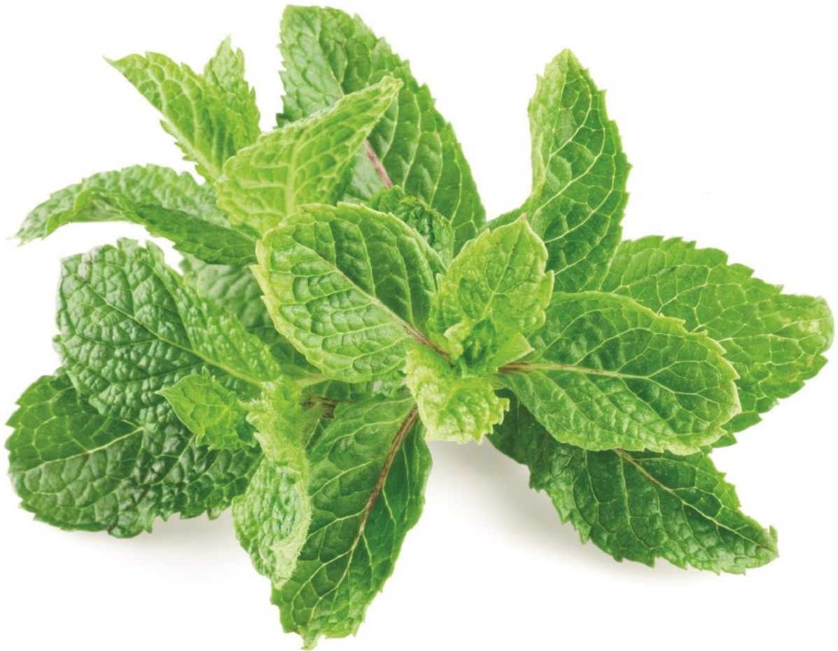
Peppermint— Mentha × piperita

Analgesic, Anesthetic, Antiseptic, Antispasmodic, Astringent, Carminative, Decongestant, Emmenagogic, Expectorant, Nervine, Stimulant, Vasoconstrictor