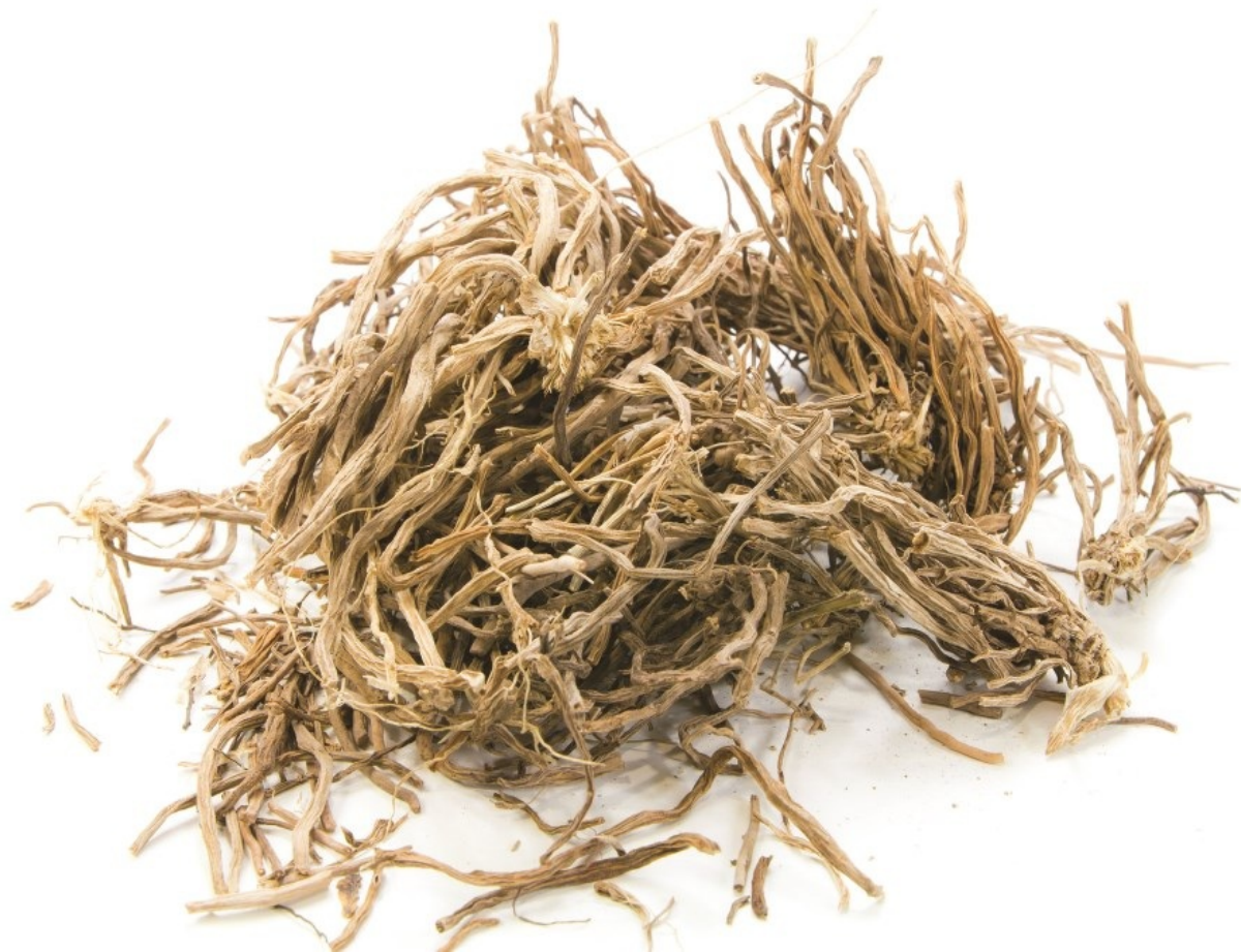
Vetiver— Vetiveria zizanioides

Antibacterial, Antidepressant, Antifungal, Anti-inflammatory, Antiseptic, Circulatory, Immune-system support, Nervine, Sedative, Tonic