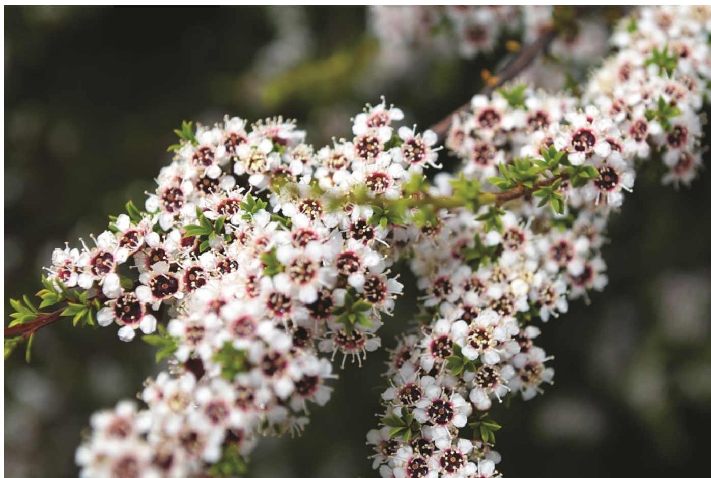
Kanuka— Kunzea ericoides

and support a restorative sleep. The leaves and twigs are steam distilled to release a pale yellow/green top-note oil that is high in monoterpenes with an aroma that is sweet, minty, and herbaceous. Oils that blend well with kanuka are cedarwood, lavender, lemon, lemon myrtle, and sandalwood.