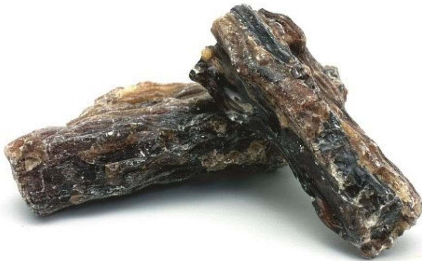
Benzoin— Styrax benzoin

ingredients. This anchors the scent and improves stability of the perfume. It will blend well with juniper, lavender, myrrh, sandalwood, and spice oils.