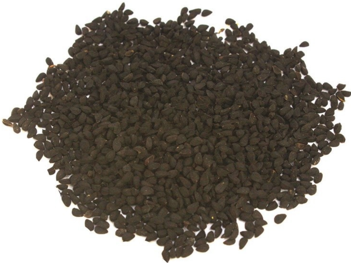
Blackseed— Nigella sativa

The first reported discovery of blackseed, a.k.a. black cumin, was in Egypt in the tomb of the pharaoh Tutankhamen. Other reports suggest Cleopatra used the oil as a beauty treatment, Queen Nefertiti used it to bring luster to her hair and nails, and Hippocrates used it to assist with digestive and metabolic disorders. The Romans made use of it to flavor food, and the French substituted it for pepper. Its rich history spans more than 3,000 years. Blackseed is part of the buttercup family, and its seeds are dark, thin, and crescent shaped. It is from the seed that the oil comes to us through steam distillation. It is a medium viscosity that varies in color from dark yellow to deep brown depending on the color of the seeds. The aroma is spicy, almost peppery. The oils that blend well with it are cardamom, lavender, rosemary, and rosewood.