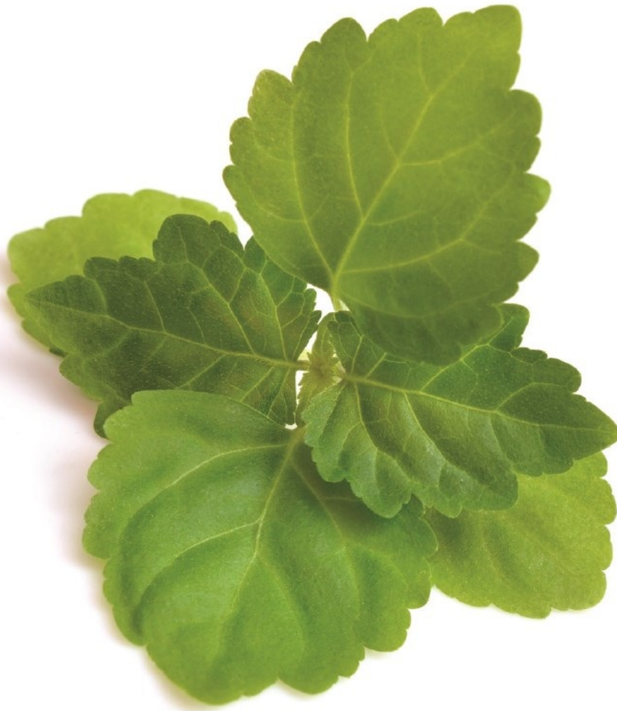
Patchouli— Pogostemon cablin

Antianxiety, Antibacterial, Antidepressant, Antifungal, Anti-inflammatory, Calmative, Cicatrizant, Insect repellent, Sedative, Wound healing