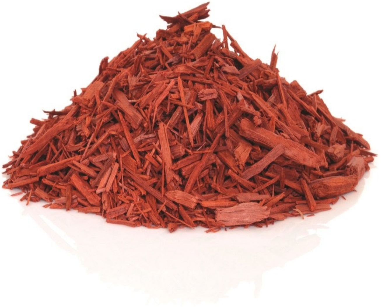
Buddha Wood— Eremophila mitchellii

oil found within the wood and discovered unique properties that could be used as perfume fixatives. The trees are plentiful and harvested in the wild. The oil is from steam distillation of the wood, being a base note and high in ketones, sesquiterpenes, and sesquiterpenols. The aroma is woody, almost whisky-like, making it a great blending oil. It is viscous (like honey) and brown to yellowish brown in color. Oils that complement it are cypress, lemon myrtle, and sandalwood.