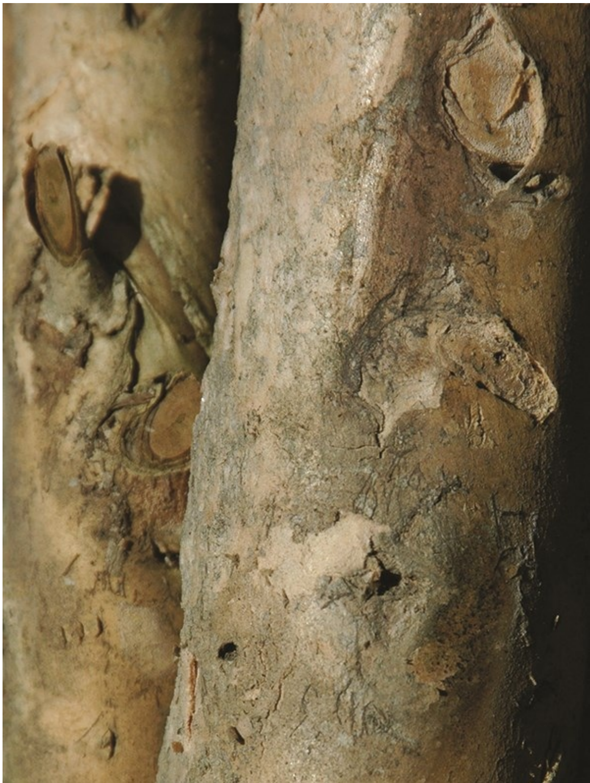
Cajeput— Melaleuca cajuputi

Oils that blend well with cajeput are bergamot, clove, eucalyptus, geranium, lavender, and thyme.