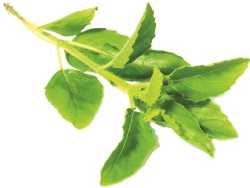
Basil, Holy— Ocimum sanctum

Analgesic, Antibacterial, Antidepressant, Anti-inflammatory, Antispasmodic, Stress relief, Uplifting