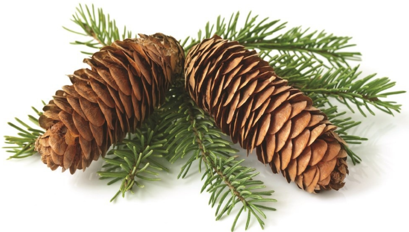
Fir Needle, Balsam— Abies balsamea

expansion. Since balsam fir is a natural laxative, herbal teas were made from the twigs; needles were used in sweat baths (similar to a sauna) for inhalation to clear up congestion from colds and coughing. Needles, twigs, and branches are used for steam inhalation to release the top to middle note of the oil. The oil is high in monoterpenes, and the aroma is fresh, piney, woody, and warm. Balsam fir blends well with basil, cajeput, cinnamon, clove, frankincense, lavender, lemon, black pepper, and peppermint.