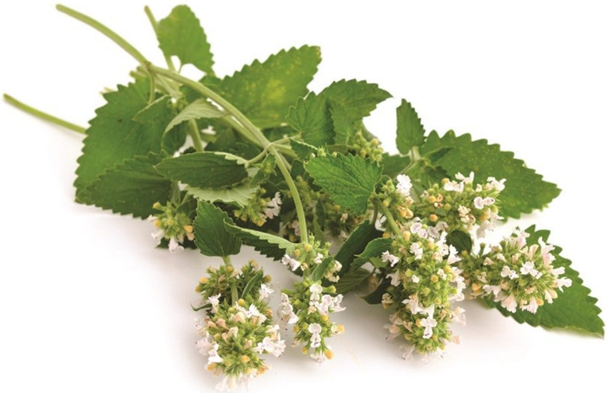
Catnip— Nepeta cataria

Anti-inflammatory, Antirheumatic, Antispasmodic, Carminative, Nervine, Sedative