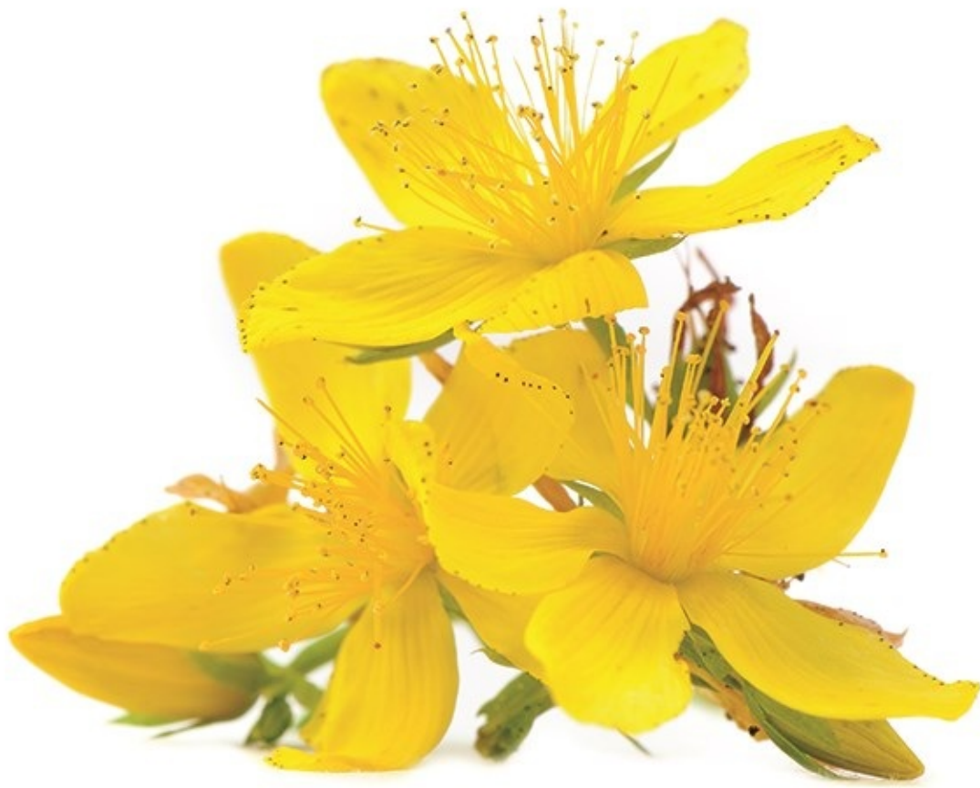
St. John's Wort— Hypericum perforatum

spinal disorders. It can be used in tea, in tinctures, and on burns. The flowers are a beautiful deep golden yellow with see-through pockets throughout the leaves. The flowers are steam distilled to release a pale yellow, middle-note oil high in the chemical families of monoterpenes and sesquiterpenols. The aroma is sweet, herbaceous, warm, and balsamic. Oils that blend well with St. John's wort are cedar, clary sage, helichrysum, lavender, Roman chamomile, rosemary, and vetiver.