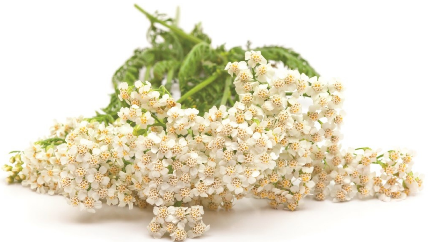
Yarrow, Blue— Achillea millefolium

Blue yarrow is a tenacious perennial herb that can grow just about anywhere. History tells of it being used in ancient Greece for healing wounds of soldiers and in China for menstrual challenges and hemorrhoids. The flowers and leaves are steam distilled to release a middle-note oil high in monoterpenes and sesquiterpenes. The beautiful blue color happens in the distillation process. The aroma is herbaceous, soft, and a bit floral. Oils that blend well with blue yarrow are camphor, lavender, geranium, and tea tree.