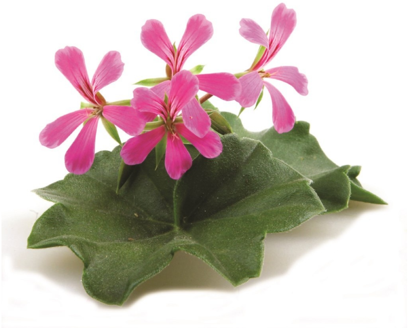
Geranium Bourbon (Rose)— Pelargonium graveolens

Antidepressant, Antifungal, Anti-inflammatory, Antiseptic, Astringent, Calmative, Immune-system stimulant, Nervine