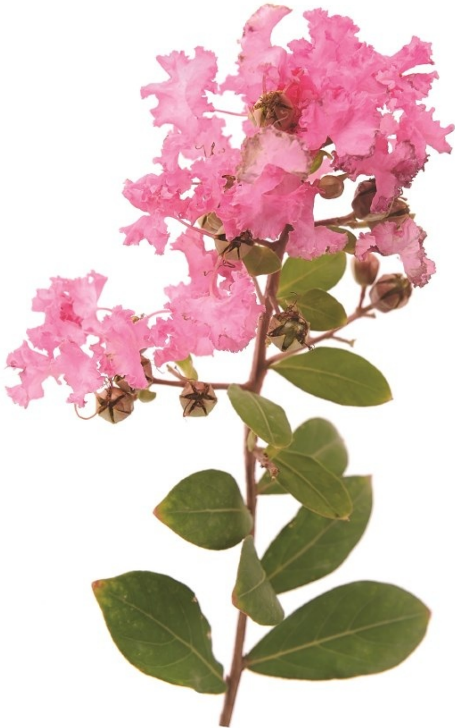
Myrtle, Red— Myrtus communis

Anti-infective, Antiseptic, Antispasmodic, Carminative, Expectorant, Skin toner