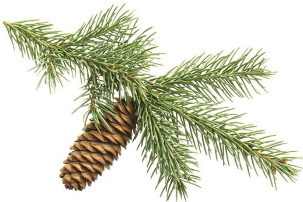
Fir Needle, Douglas— Pseudotsuga menziesii

Anti-inflammatory, Antiseptic, Decongestant, Expectorant, Immune-system stimulant, Skin cleansing/purifying, Warming