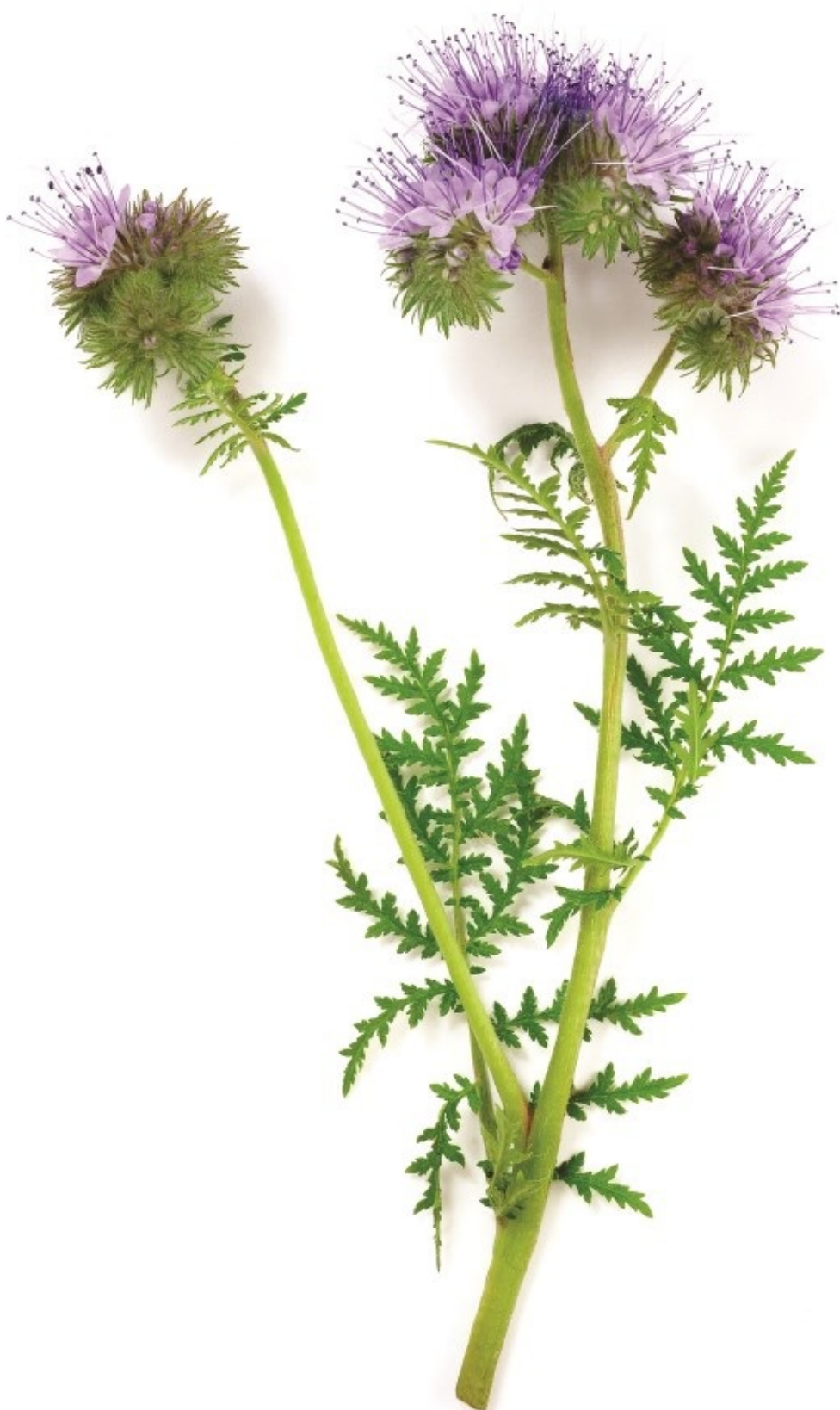
Tansy, Blue— Tanacetum annuum