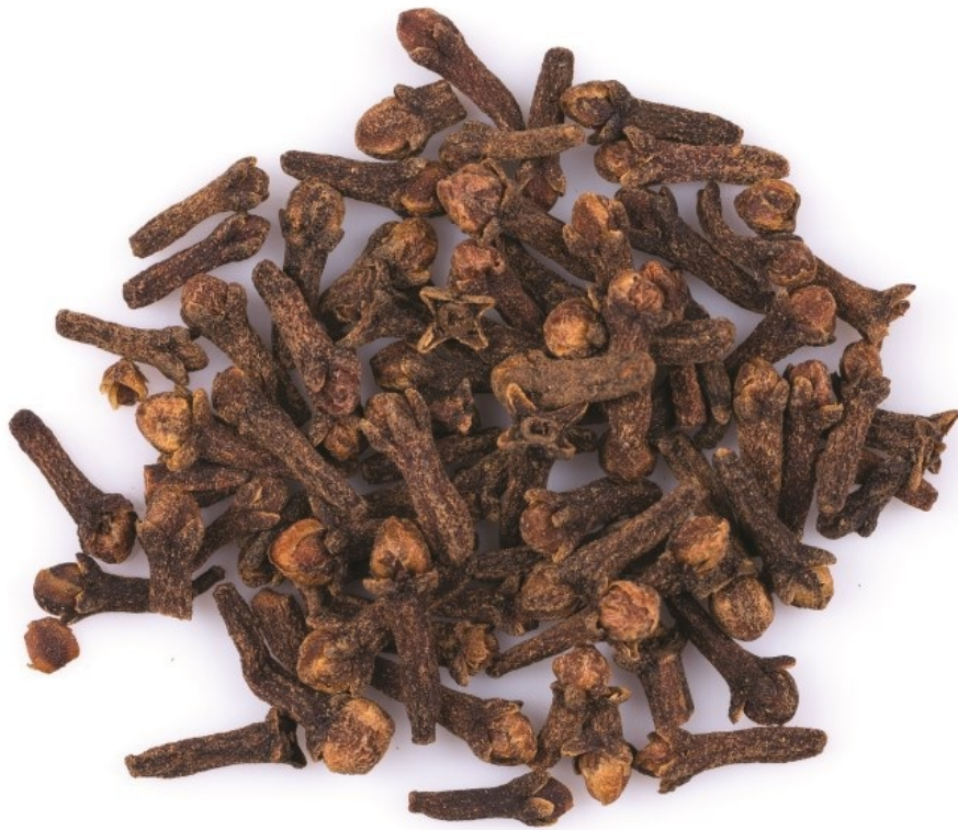
Clove Bud— Eugenia caryophyllata

Analgesic, Anti-infective, Antineuralgic, Antiseptic, Antispasmodic, Carminative, Insecticidal, Stimulant, Warming