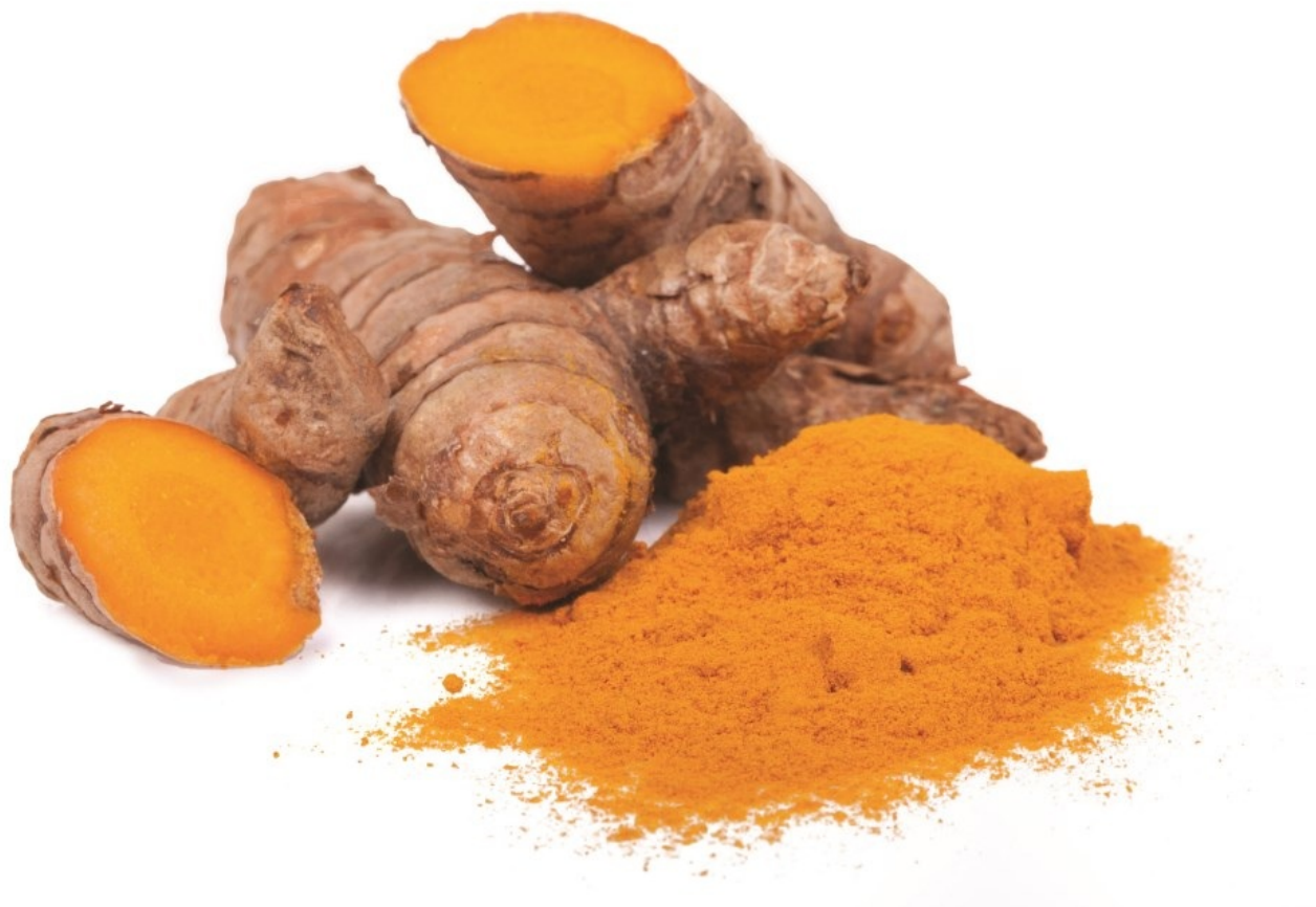
Turmeric— Curcuma longa

woody undertones. Oils that blend well with turmeric are cinnamon, clary sage, ginger, grapefruit, blood orange, and ylang-ylang.