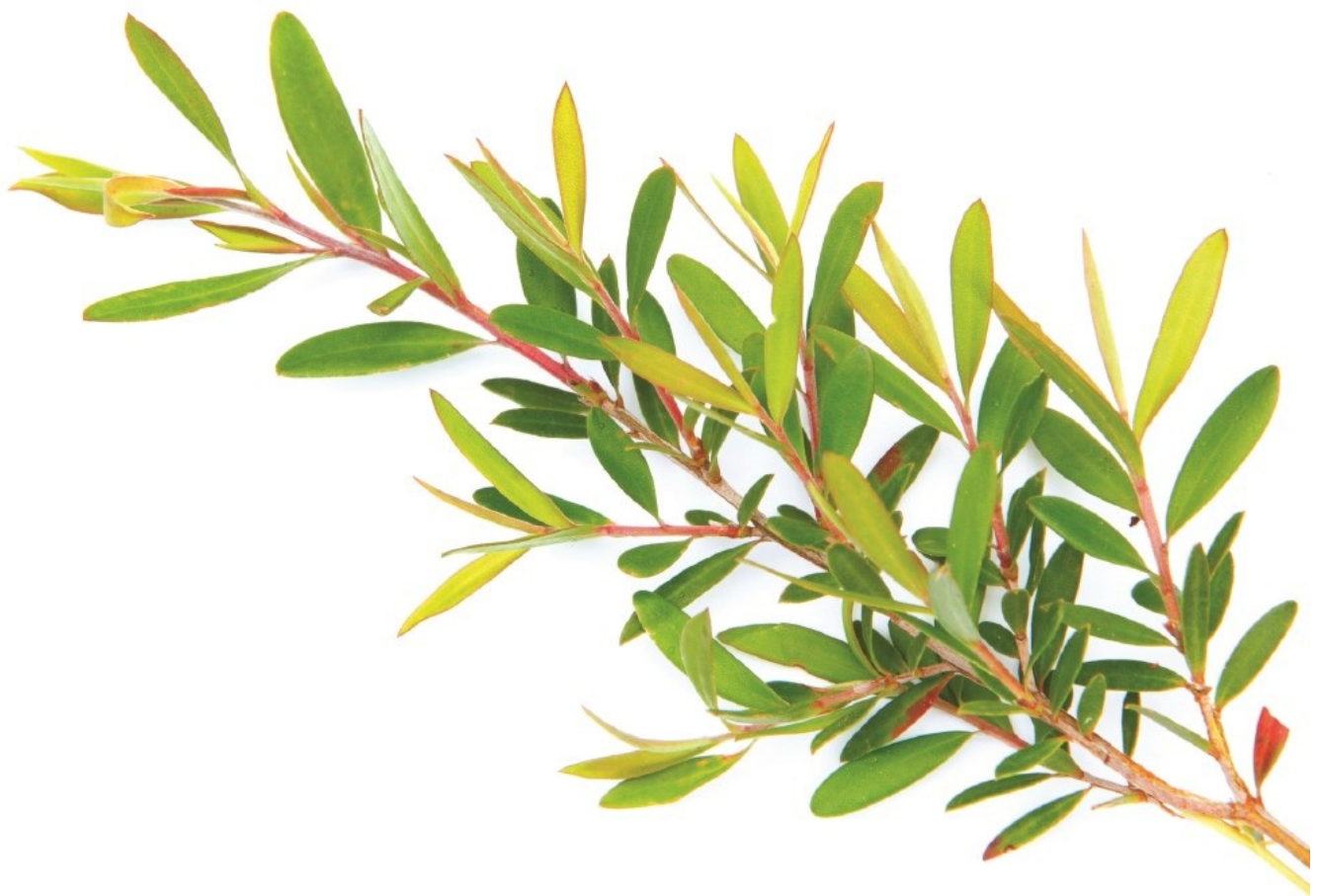
Tea Tree— Melaleuca alternifolia

Aborigines have used the tea tree, which comes from New South Wales in Australia, medicinally for a very long time. It is an oil that every home seems to have to treat topical infections. It is antibacterial and so has been used for staph infections. Tea tree oil is found in soaps, creams, lotions, air fresheners, deodorants, and disinfectants. The leaves are steam distilled to release a middle-to-top-note oil high in monoterpenes and monoterpenols. The aroma is on the pungent side, medicinal, camphorous, and fresh. Oils that blend well with tea tree are clary sage, clove, geranium, lavender, lemon, myrrh, rosemary, and thyme.