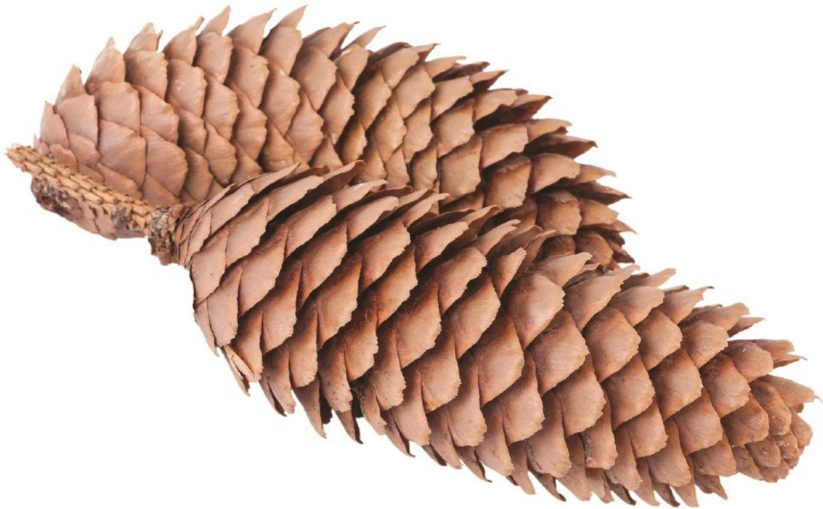
Spruce, Black— Picea mariana

Analgesic, Antianxiety, Antibacterial, Antifungal, Anti-inflammatory, Antioxidant, Antirheumatic, Diuretic, Mucolytic, Warming