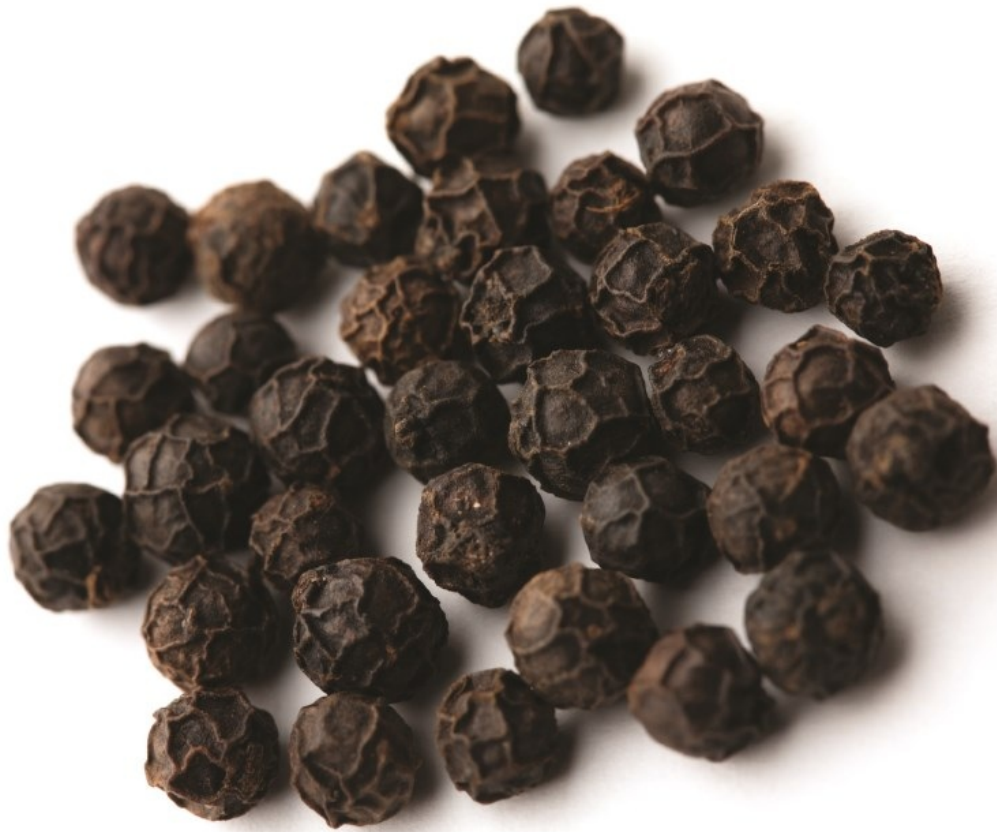
Pepper, Black— Piper nigrum

Analgesic, Antioxidant, Antiseptic, Antipasmodic, Digestive, Diuretic, Laxative, Warming