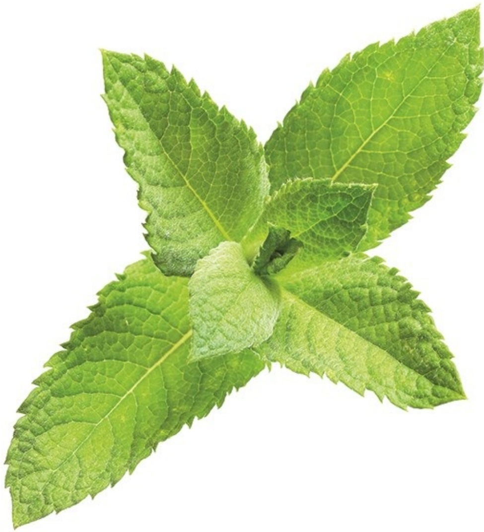
Spearmint— Mentha spicata

Antiseptic, Antispasmodic, Carminative, Cephalic, Emmenagogic, Insecticidal, Relaxant, Restorative, Stimulant