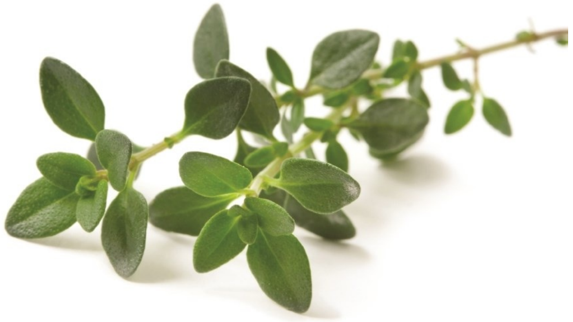
Thyme— Thymus vulgaris

Ancient Greece, Rome, and Egypt used thyme medicinally, in worship, and in the embalming process. During the Middle Ages knights used it for courage, and courtrooms had sprigs in the open to purify the air from germs. Thyme is an evergreen shrub that will grow up to eighteen inches in height. The leaves are very aromatic, and the flowers can be either purple or white. The flowers and leaves are steam distilled to release a reddish-brown, middle-note oil high in monoterpenes and phenols. The aroma is sweet, herbal, spicy, warm, and herbaceous. Oils that blend well with thyme are bergamot, grapefruit, lavender, lemon, pine, and rosemary.