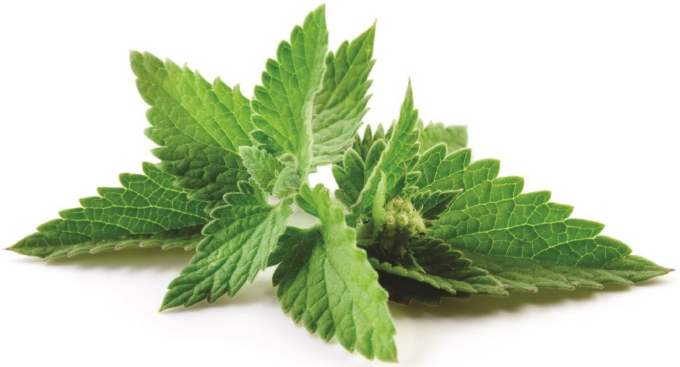
Melissa— Melissa officinalis

Antidepressant, Antipyretic, Antispasmodic, Bactericidal, Hypotensive, Nervine, Sedative, Tonic