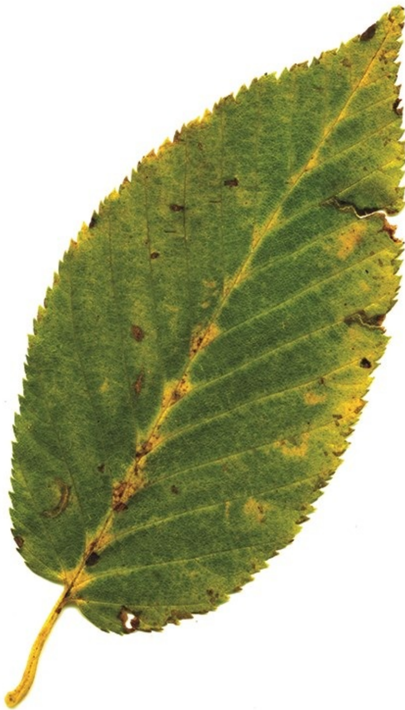
Birch, Sweet— Betula lenta

Analgesic, Antiarthritic, Anti-inflammatory, Antirheumatic, Antiseptic, Antispasmodic, Diuretic, Warming