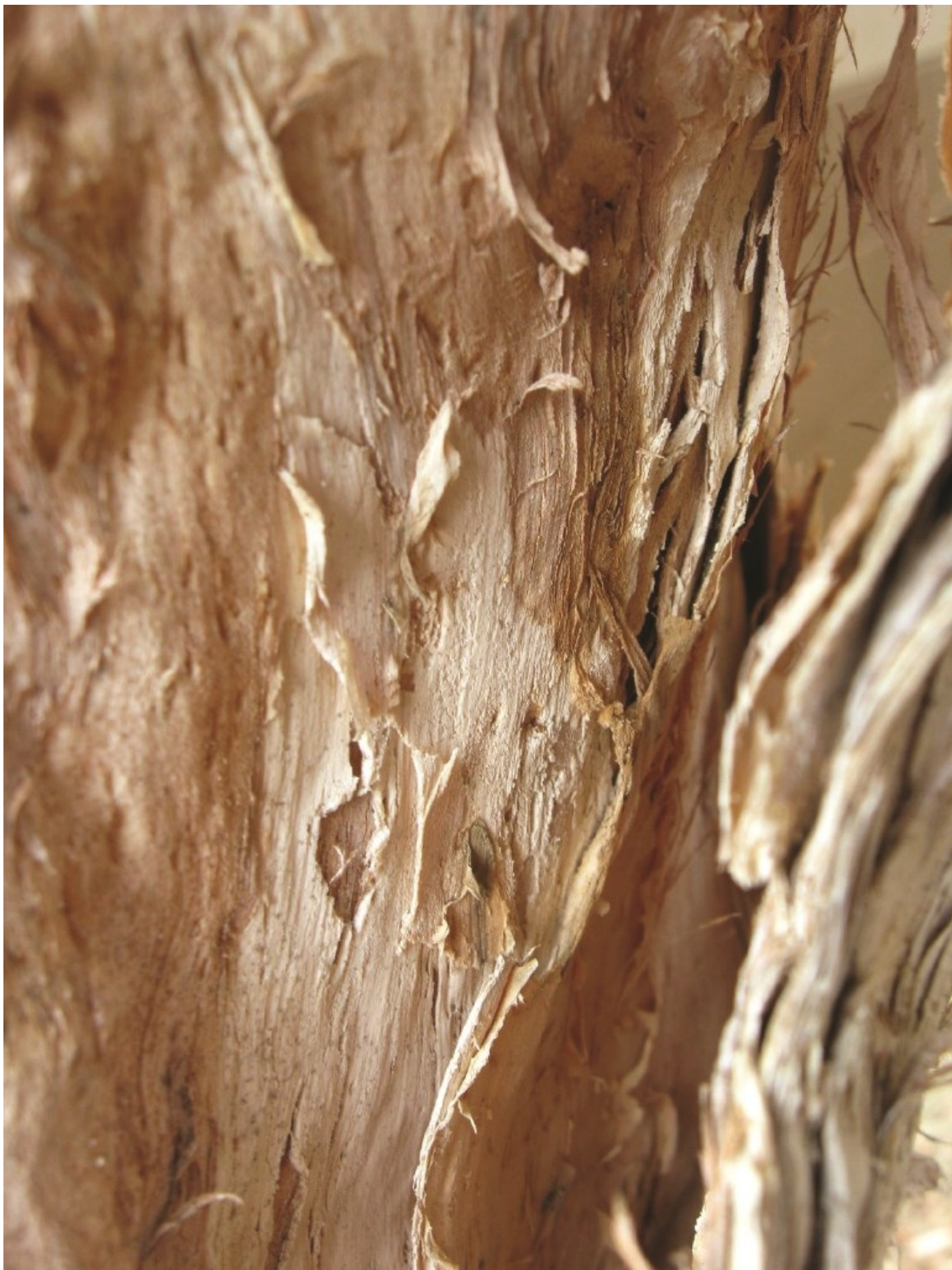
Niaouli— Melaleuca quinquenervia

Analgesic, Antiallergenic, Antibacterial, Antifungal, Anti-infective, Anti-inflammatory, Antimicrobial, Antiviral, Decongestant, Immune-system stimulant