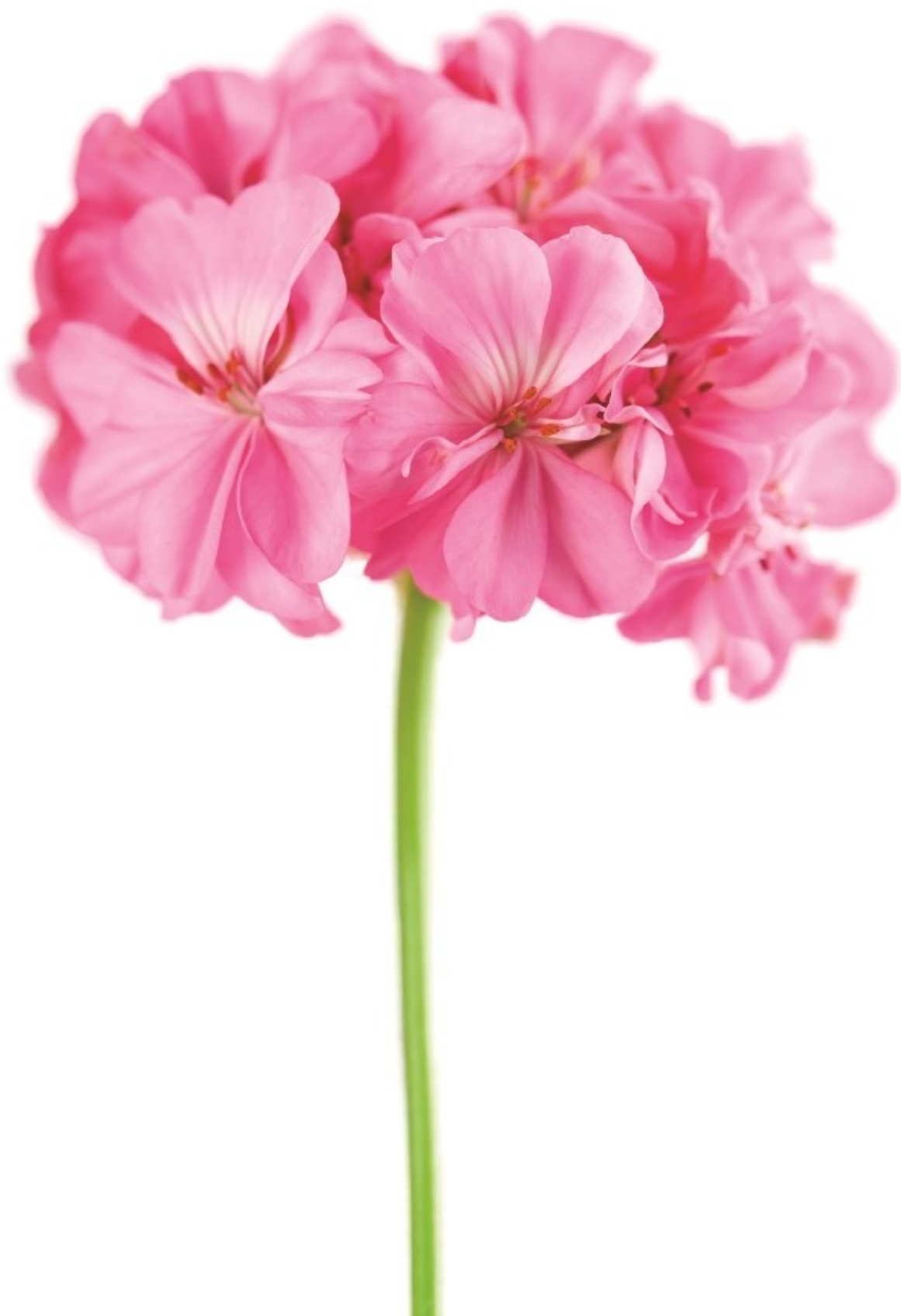
Geranium— Pelargonium graveolens