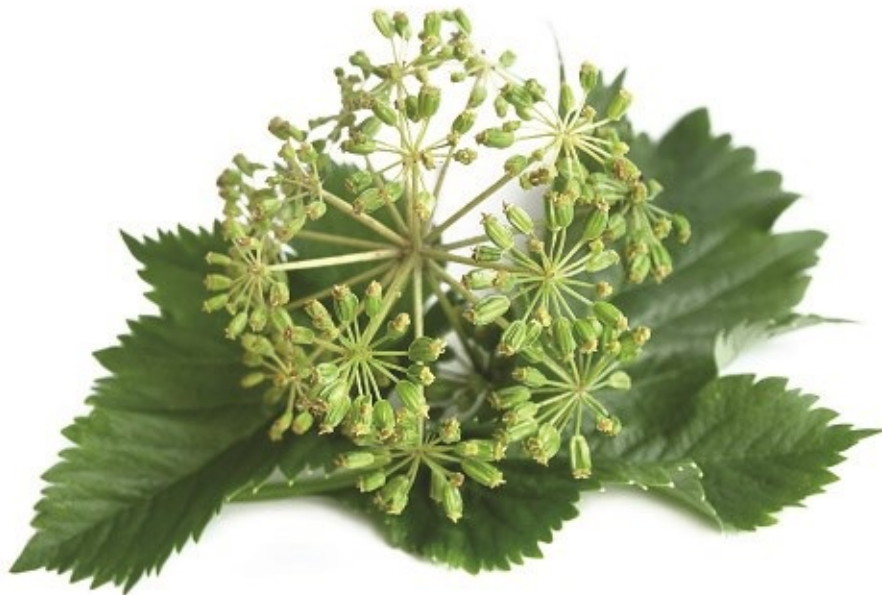
Angelica— Angelica archangelica

Antibacterial, Anti-infective, Anti-inflammatory, Antiseptic, Carminative, Decongestant, Diuretic, Expectorant, Grounding, Uplifting