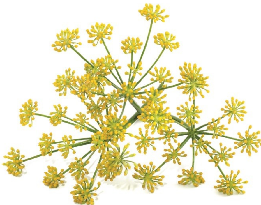
Fennel, Sweet— Foeniculum vulgare v. dulcis

exotic, slightly spicy, and earthy. The oil blends well with geranium, lavender, orange, rose, and sandalwood.