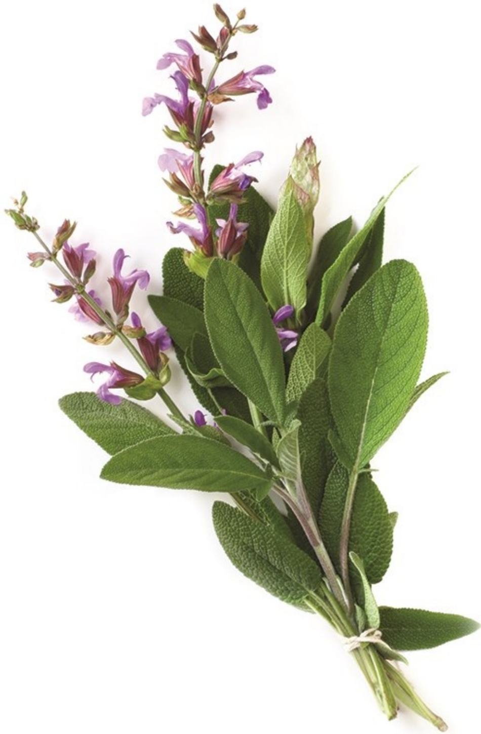
Sage, Spanish— Salvia lavandulifolia

Analgesic, Antianxiety, Antiasthmatic, Antibacterial, Antidepressant, Anti-infective, Anti-inflammatory, Antirheumatic, Calmative, Decongestant, Hormone balancing