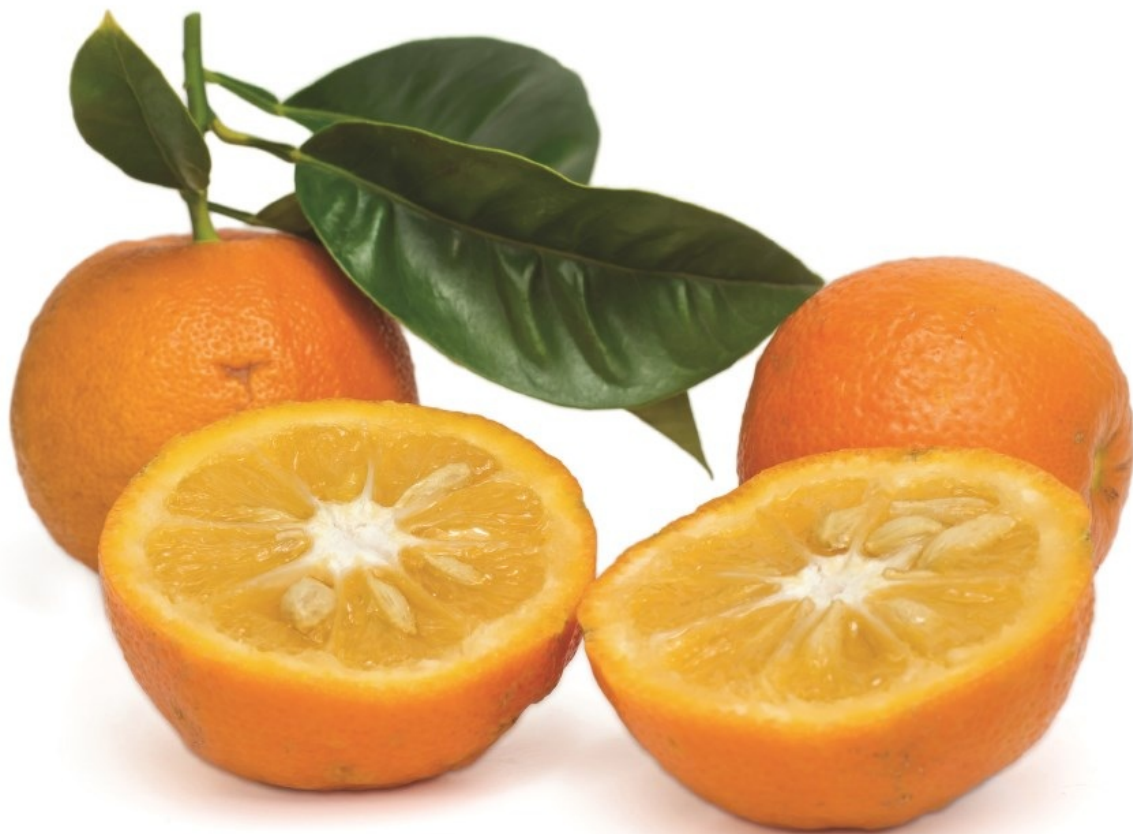
Petitgrain— Citrus aurantium var. amara

Petitgrain is one of three oils from the orange tree. Neroli is from the flowers, orange is from the rind, and petitgrain is found in the leaves. What a gift the orange tree is to us! Petitgrain has been used in South America, China, Haiti, Italy, and Mexico for cold, fever, digestive spasms, nausea, vomiting, and skin challenges. The leaves are steam distilled to release a pale yellow to amber oil that is a middle note, high in esters and monoterpenols, with a watery viscosity. The aroma is woody, floral, sensual, slightly sweet, and citrus. Oils that blend well with petitgrain are bergamot, geranium, lavender, palmarosa, rosewood, and sandalwood.